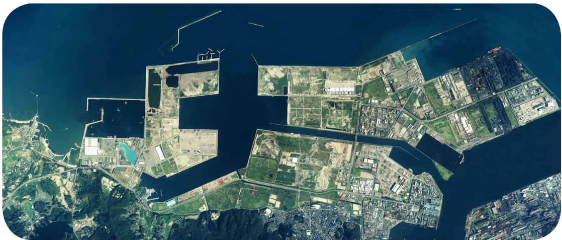
Birds' eye view of the Kitakyushu Eco-Town

Kitakyushu Eco-Town came about in response to the city's history as a leading industrial hub throughout Japan's pre-war industrialization, followed by economic growth in the 1960s. Since its first steel plant opened in 1901, Kitakyushu has been home to many heavy industries such as chemicals, steel, glass, cement, bricks, and power generation. With the growth of such industries, pollution became a serious problem. Skies were filled with 'seven colours of smoke' due to red iron oxide particles and dust from coal. The nearby sea was dubbed the 'sea of death' after a study revealed that not even bacteria could survive in its toxic waters.