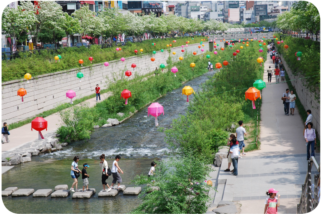
The Cheonggyecheon after restoration

discuss issues relating to the Cheonggyecheon and recommend solutions. 332 The public now have access to valuable educational resources through their renewed contact with nature, restored historical sites, and the Cheonggyecheon Museum. 333