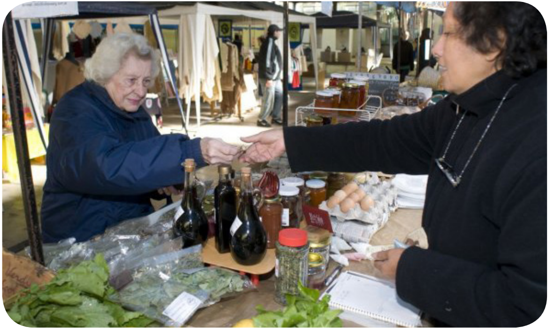
Bonpland Market, Buenos Aires

The promoters train urban gardeners in the preparation of the land for food, and the construction of tools for small scale farming. Food produced in home gardens and orchards is typically consumed by the farmers' families, and community gardens serve those who do not have outdoor space at home. Home gardens of around 100 m 2 are suitable for feeding families, but schools require around 200 m 2 and community gardens are closer to 1,000 m 2 in size. The average annual production of a family garden is over 200 kg of fresh vegetables, which can feed a family of five. Some gardens are also able to supply eggs and meat from chickens and rabbits. 236