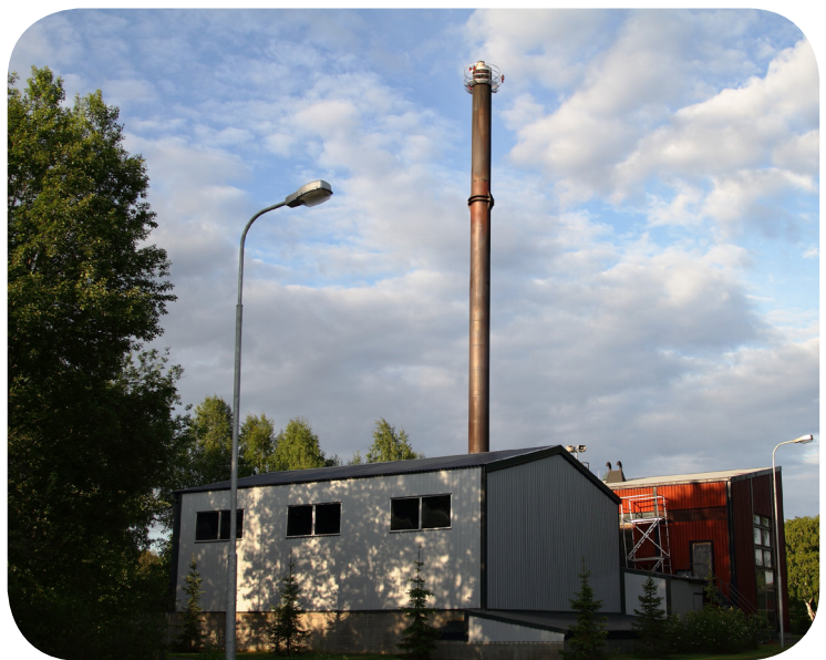
District heating in Parikkala has been converted to renewable sources, mainly wood chips

In the first phase of the project, the current GHG emissions were assessed by SYKE in order to establish baseline emissions in 2007. In addition, on-line GHG emission monitoring is now possible for each of the municipalities involved in the project. The relevant energy companies offer weekly data on the use of fossil fuels for the purpose of the calculation system. This feedback is used for