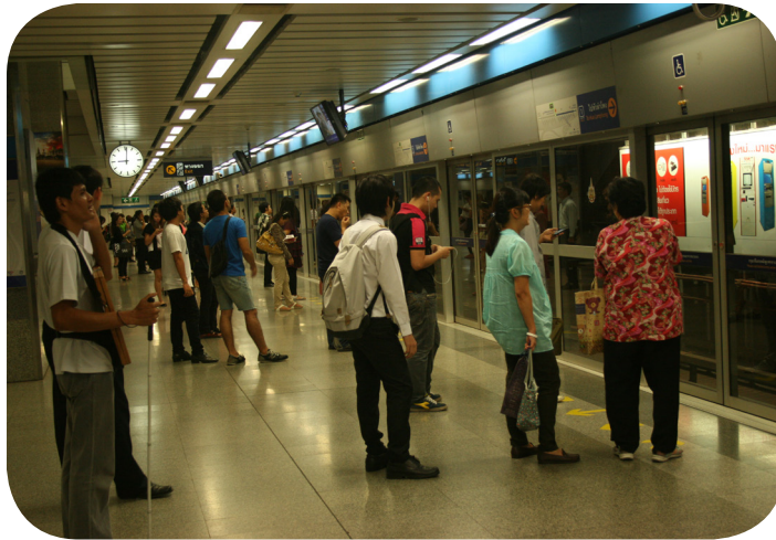
Bangkok Subway (MRT)

condominium projects in the inner areas of the city. Property developers used to promote their projects by stating how close they were to expressways; now they boast the proximity to transit stations.