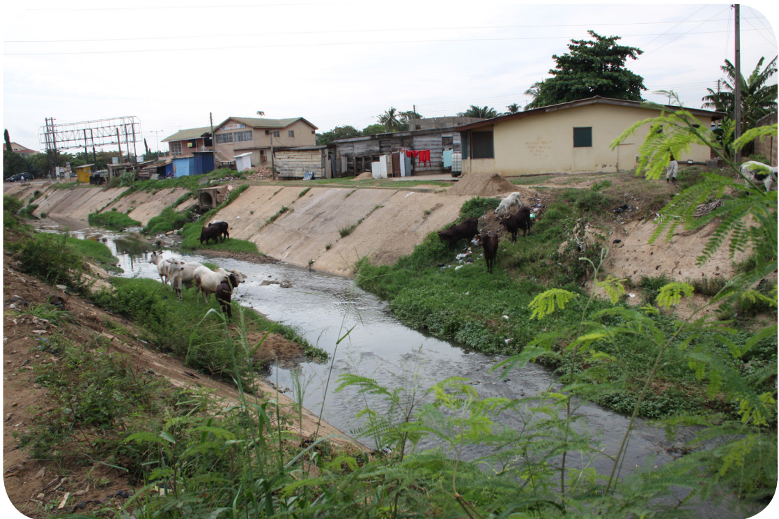
Encroachment on the banks of one of the city's drainage channels.

The Resource Centres on Urban Agriculture and Food Security estimates that approximately 1,000 farmers are engaged in urban agriculture in Accra, but absolute numbers are unknown given the informal nature of the activity. The reluctance of State and Traditional Authorities to institutionalise urban agricultural activities in Accra has made comprehensive evaluations