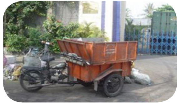
Solid waste collection by motor tricycle