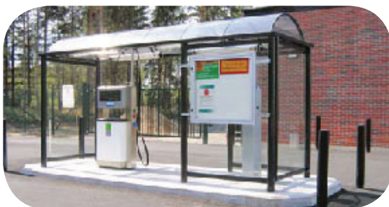
Bio-gas is now available as a vehicle fuel in Växjö

The district heating system in Växjö is unique in the way it has included old buildings. District heating systems using renewable energy exist in other cities, but old buildings are seldom connected to them due to the