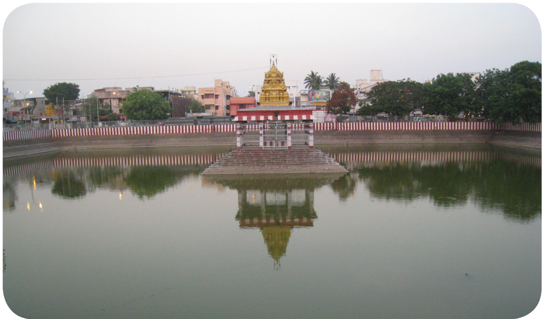
The Marundeeswarar Temple Tank, Thiruvanimiyur, Chennai following restoration and the installation of barricades

awareness-raising activities was to stimulate a voluntary spirit, so that members of the community, irrespective of class or values might come together to help clean out the tank. Here the efforts to appeal across class and caste boundaries can be seen to have backfired: despite the origins of the leader of the Puduvellam initiative, he could not successfully engage other middle-class residents who were reluctant to 'muck in' with those of a lesser social standing, and instead came to view Puduvellam as a charitable cause. Instead of taking ownership of the project, the middle class separated themselves as an influential external group who employed the poor to clean the tank, but did not partner with them to build social cohesion between the classes.