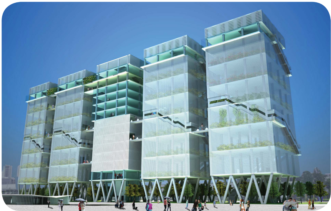
RMIT University, Melbourne

The 2008 figures showed a reduction of 41% in city operation emissions from 1997, 132 close to the interim target of 50% by 2010. Primarily achieved through the implementation of energy efficiency measures in public buildings and lighting; public engagement initiatives have seen further reductions in emissions. These include the Postcode 3,000 programme encouraging people to move back to the inner city by providing financial incentives as well as technical and street-level support. The mandatory requirement for extensive developments to have energy performance ratings of 4.5 stars under the Australian Buildings Greenhouse Rating Scheme (ABGR); the implementation of a house auditing programme; and the CitySwitch Green Office alliance, which works with commercial building tenants 133 have all contributed to reducing energy emissions in the building sector.