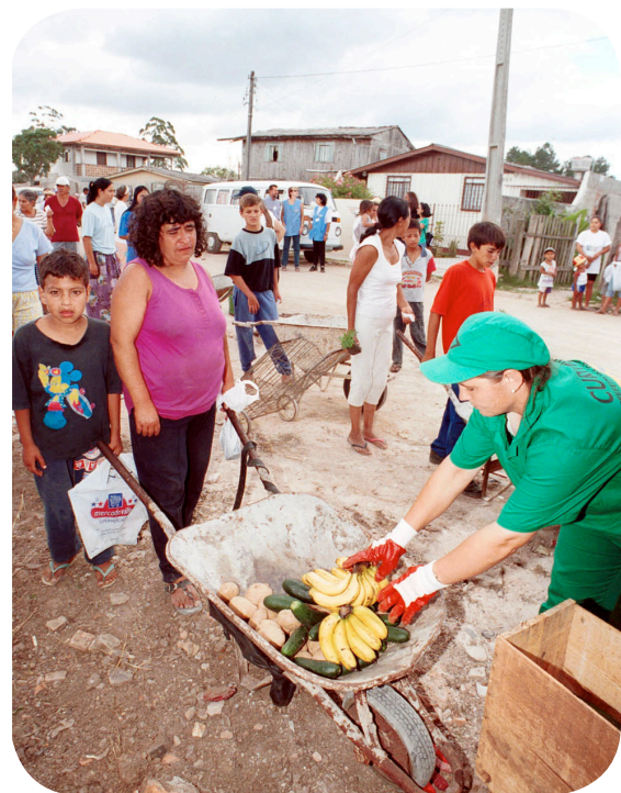
Recyclers receiving fresh fruit and vegetables in exchange for recyclables

Following initial success, an undesirable side effect of this approach became apparent when informal collectors started to encroach on areas serviced by formal collections. Formal collection soon became unprofitable because the domestic waste was removed before the trucks had a chance to collect it. In addition, the informal collectors' carts started causing traffic problems as they made their way around the city without adhering to the rules of the road or safety protocols.