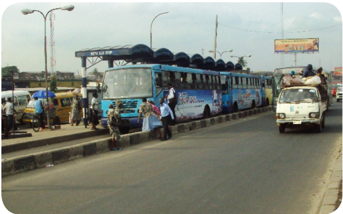
Demarcation of carriageway on Ikorodu Road

The wide acceptance of the BRT scheme has been facilitated by involving different groups of stakeholders through community engagement programs. These interactions have ensured that BRT-Lite is seen as a project created, owned and used by Lagosians. Through this approach, a sense of local ownership was developed that resulted in BRT-Lite being seen as designed for its users, rather than for bureaucrats. Third party advocacy was also employed whereby opinion leaders (local government chairmen, local chiefs and community leaders) were invited to discussions on the operation of BRT, and its benefits to the people. This group of stakeholders went on to endorse the scheme in their local communities. A public education campaign on the BRT was also carried out, including advertising along the BRT route and in print and electronic media. Brochures explaining the new system were produced in local languages and distributed to the general public at road-shows.