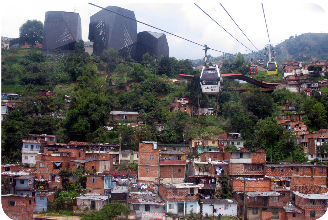
Metrocable Line K with the Parque España library in the background

The first line was made possible through the combined technical foresight of the city's publicly owned Metro de Medellín (Medellín Metro Company) and the political will of a newly elected mayor. It arose from the desire to promote social development in a deprived area, and increase passenger numbers for an underutilised overground mass-transit metro system.