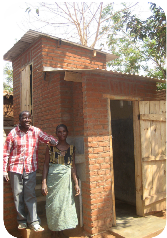
Ecosan adopters in Mtandire, Lilongwe. Ecosan adopters are predominantly landlords who invest in the facility for their own use as well as for use by their tenants.

To amplify the natural trajectory of demand, MHPF members who were the first adopters of the ecosan organised into mobilisation task teams. The mobilisation task teams function to create awareness around the space saving, food security and health benefits of ecosan. Once demand has been catalysed, households