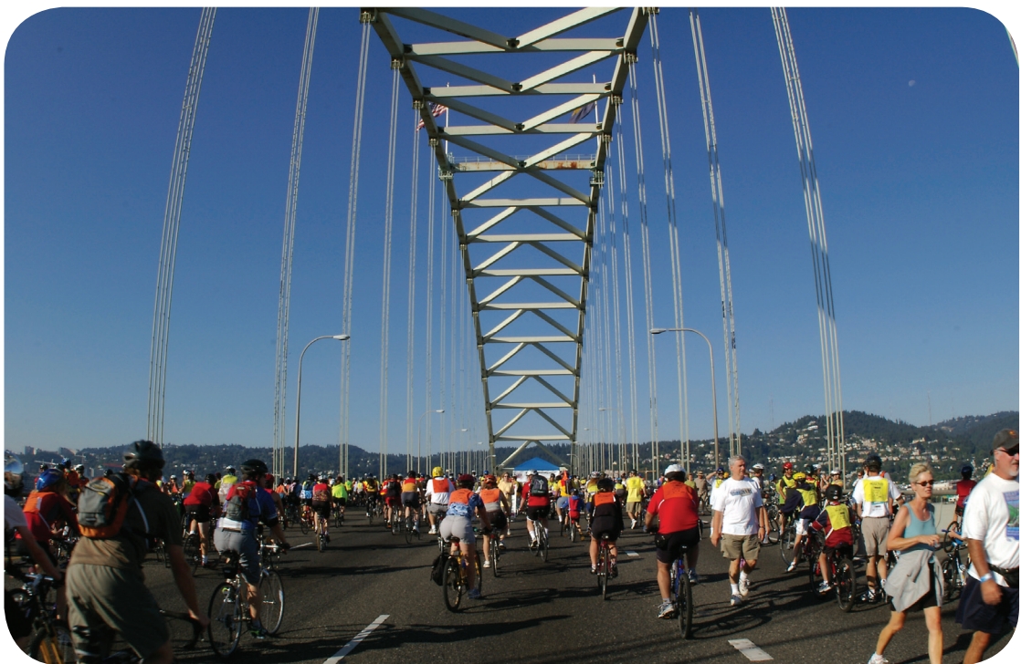
Bicycle Bridge

Portland has therefore significant knowledge resources to draw upon, including academic resources from local universities, but sourcing finance for investment purposes remains a challenge, 150 particularly in the current economic climate.