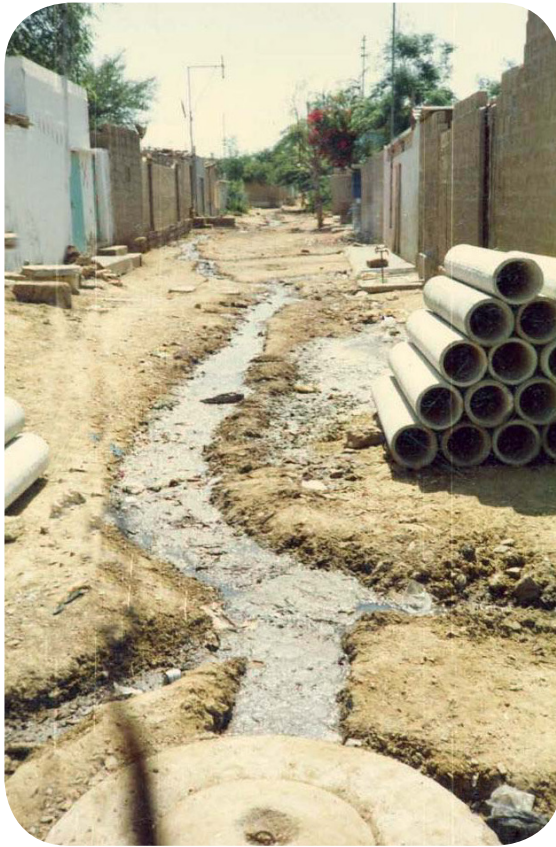
Orangi Pilot Project Research and Training Institute (OPP-RTI)

The success of the OPP's Low Cost Sanitation Program has not come easily. Over the years, it has struggled with government inconsistency and an ad hoc approach to planning. The scale of demand for services has made it difficult to respond to the large number of requests for support, and a lack of access to information adds to the challenge of disseminating ideas to the poor. The psychological barrier of dependency has been evident in low levels of confidence in people's initiatives, and has been difficult to overcome.