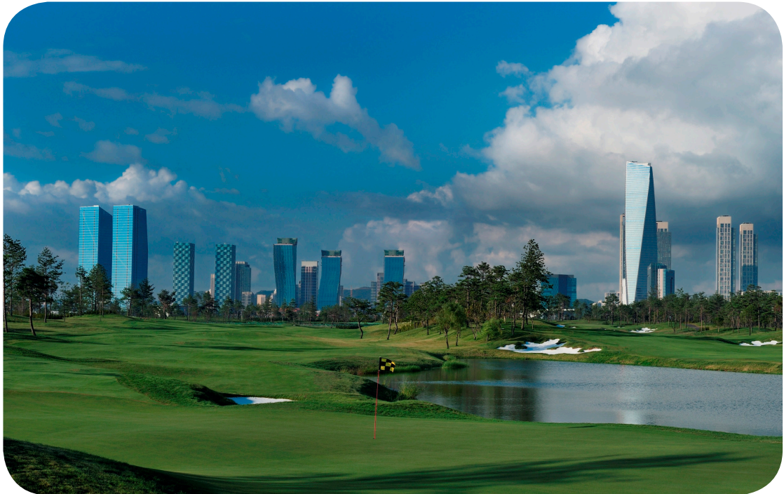
Songdo skyline viewed from the golf course

The delicate balance between maximizing energy efficiency and sustainable design versus project development costs is an area that has received much attention during design and construction of Songdo. Project funding consists of US$35 billion borrowed by Gale International from the domestic South Korean financial market, and US$100 million of Gale's own funds. More than US$10 billion has been invested thus far, and approximately 100 buildings have been completed or are currently under construction.