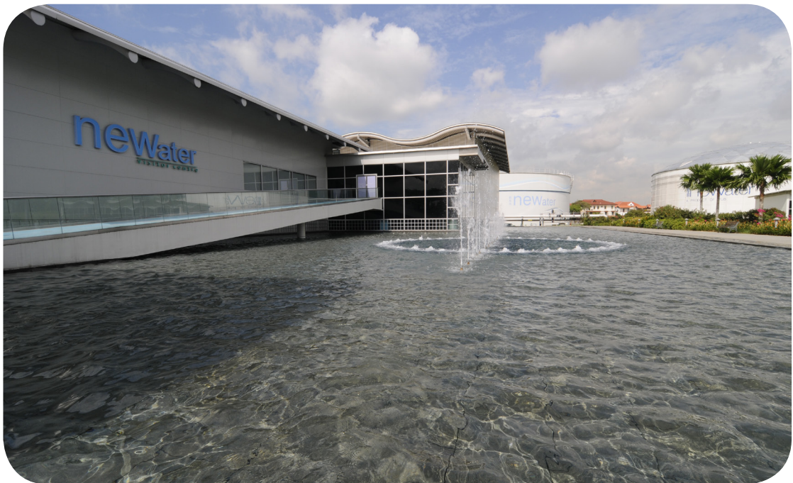
NEWater Visitor Centre, Koh Sek Lim Road, Singapore

Aligning economic growth within environmental sustainability has meant the acceptance of certain operating principles that have come to be known as the 'Singapore Way'; these include the importance of integrating and aligning planning, taking a long-view of development although it entails short-term costs, and being flexible in approach because many changes in technology and the global environment will be coming in the coming decades. 182