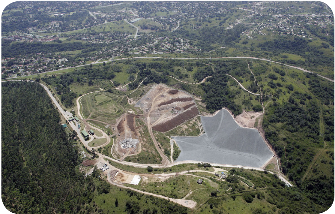
An aerial view of the Mariannahill Landfill Site.

R3 million (approximately US$338,000) on new plants. 77 The community's monitoring committee convinced Durban Solid Waste to start a plant rescue process in 1998 78 and worked towards registering the site as a national conservancy, which was achieved in 2002 - a world first for an operational landfill. 79