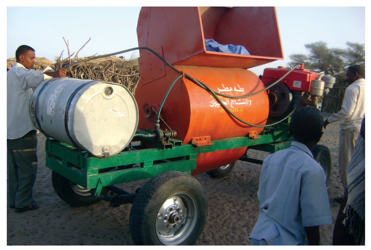
Standby generators to secure sustainable water supply