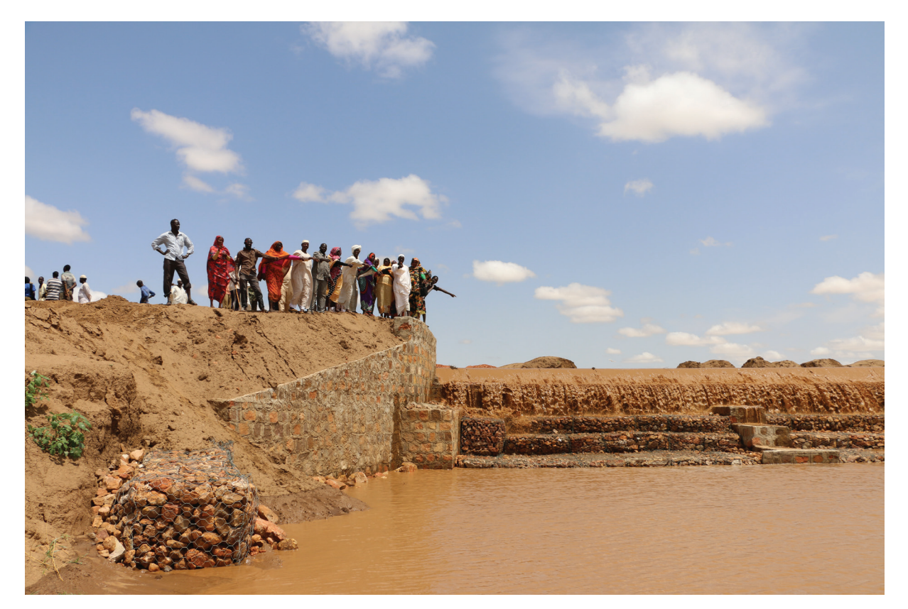
Water harvesting infrastructure for livelihoods and the environment