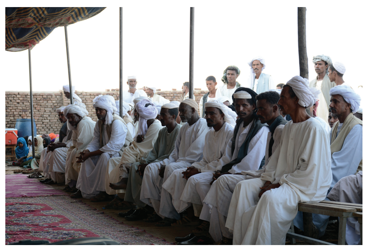
Hawata Board of Directors represented by water users Japan International Cooperation Agency (JICA)