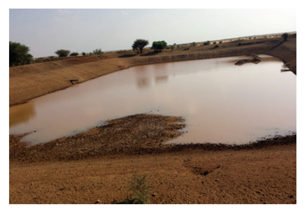
Water harvesting (hafir) for livestock in the Butana area

Ecological zonation of the Butana region was conducted. A first assessment was formed of the current state of the various natural resources and animal production conditions per agroecological zone of the Butana region and how these changed over time. This also provided practical information on the re-introduction of grass and shrub species that had disappeared, elaborated on the complexities of calculating the desirable pasture carrying capacities and included zonation maps with high resolutions. Together with the land-use maps developed through federal-level initiatives, these maps and related natural resources, animal production information (livestock and animal disease surveys, for instance) and observations provided a sound input for the process of formulating a coherent framework for governance of Butana's natural resources.