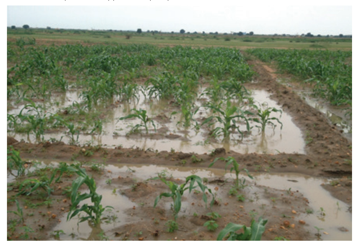
Rainfall harvesting for improved agriculture National Adaptation Programme for Action (NAPA), South Darfur

For animal protection, 8,624 farm animals were treated and 1,811 were vaccinated, 30 wooden moulds for cheese production were distributed, 108 improved breeding goat males were introduced, and pesticide application pumps were distributed.