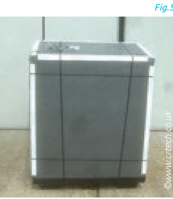
Fig.4 : Over-Cab Unit Fig.5: Nose Mounted Unit Fig.6: Inside a Home Delivery Vehicle