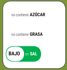
Figure 1: Ecuador's 'traffic light' food labelling system