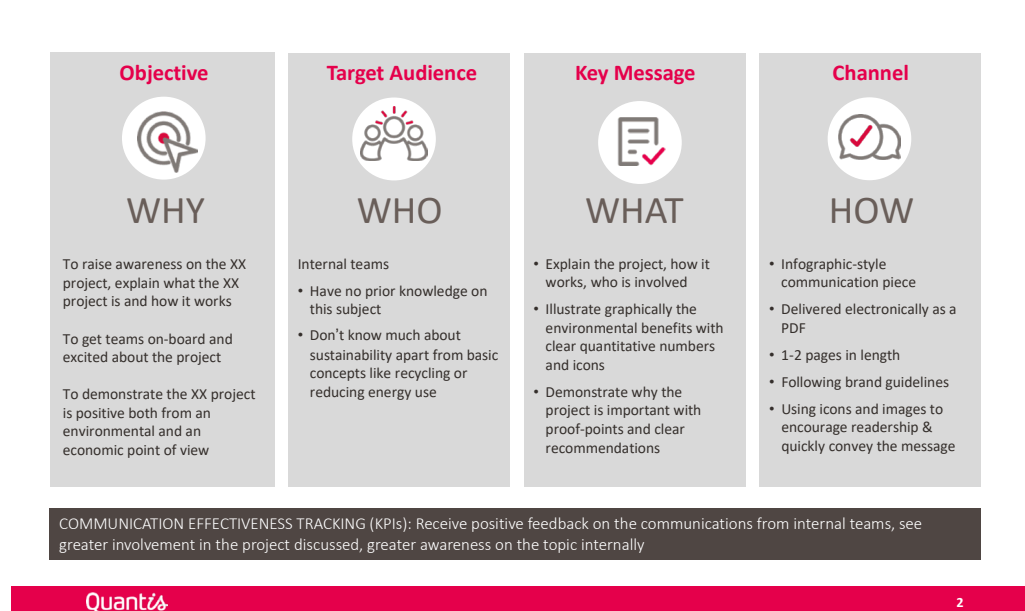
Figure 4: The Quantis Communication Canvas