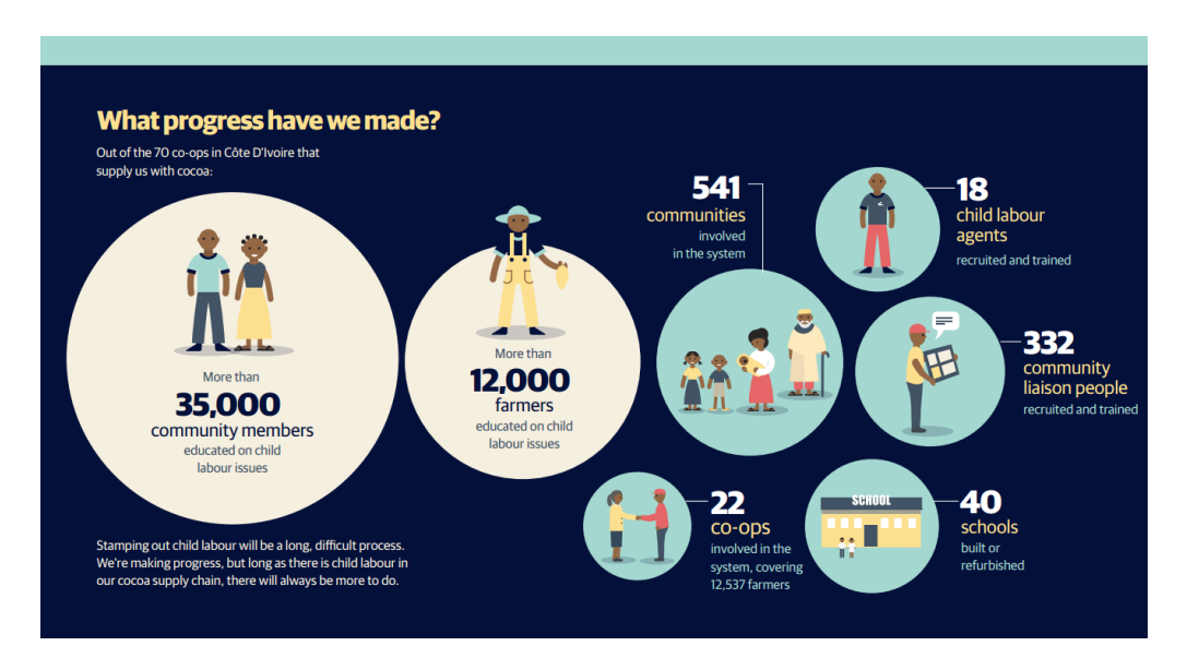
Figure 2: Communication of the progress made with the Nestlé Cocoa Plan (www.nestlecocoaplan.com)

Infographics (Figure 2) can be a user-friendly way to present products' social impacts to consumers, as figures and symbols are easy to understand in comparison with lists of figures or a long report. Colours, symbols and style can be adapted to local context, and used online and as printed posters in stores or campaigns. For example, Figure 2 communicates the interim progress that Nestle's Cocoa Plan has made and the key achievements using images and numbers to summarise highlights.