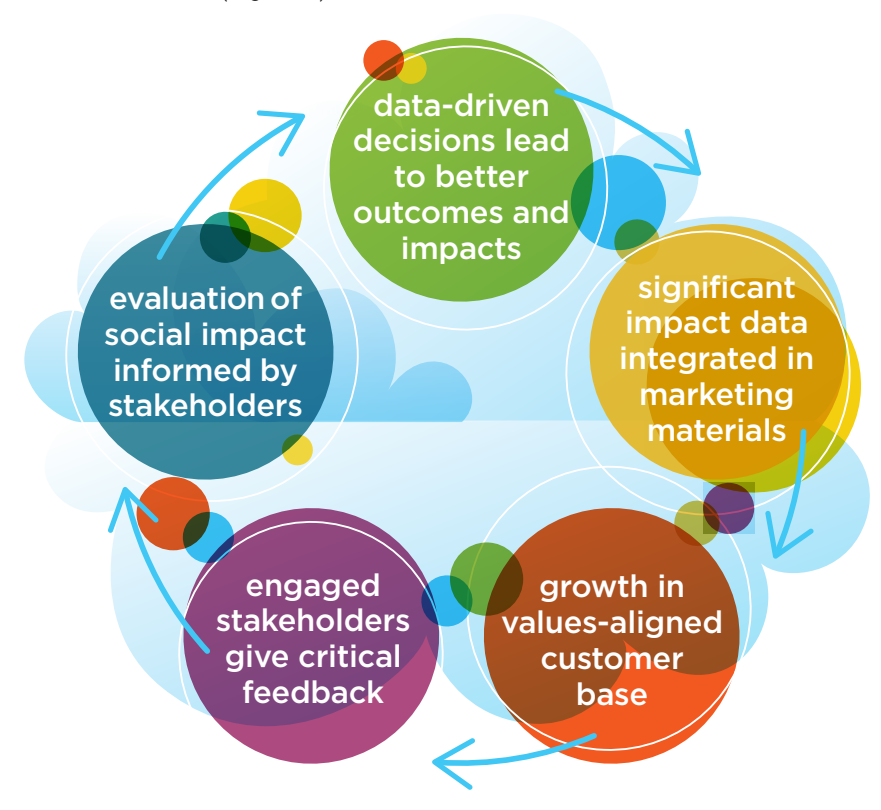
Figure 5 : The virtuous cycle of communicating social impacts (Yule G., 2016)

This approach requires not only talking 'to' consumers, but also 'with' them. This means a replacement of one-way 'push' commercial communication with a consumer engagement approach (Yule G., 2016, see for instance Box M). Feedback from all stakeholders, and consumers in particular, is a relevant source to identify emerging social issues and concerns which should be addressed in companies' business models and incorporated in their communications (Figure 5).