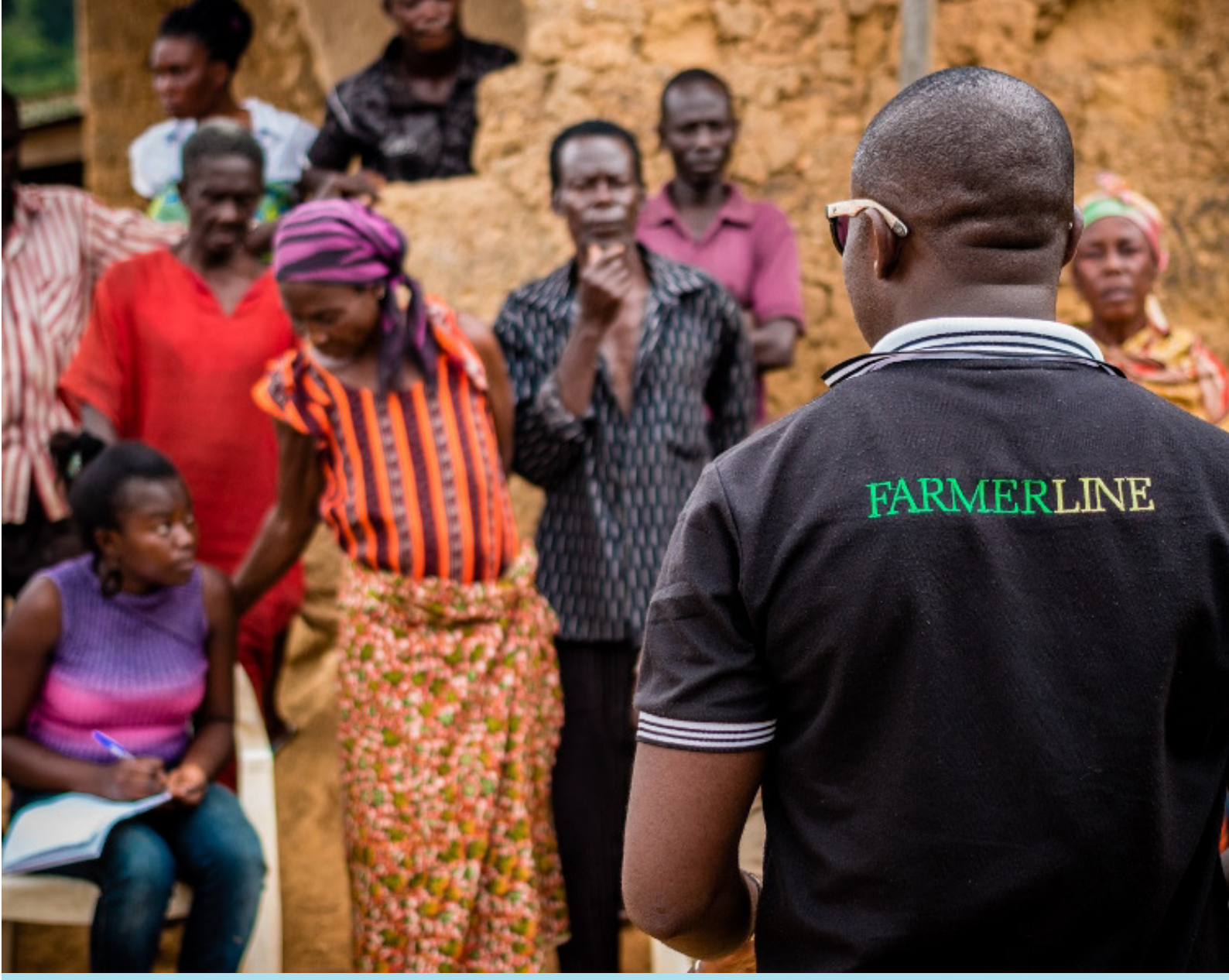
Farmerline (Ghana) staff provides information and services needed by farmers like best agronomic practices, weather data, literacy training and market prices through its developed mobile software technology.