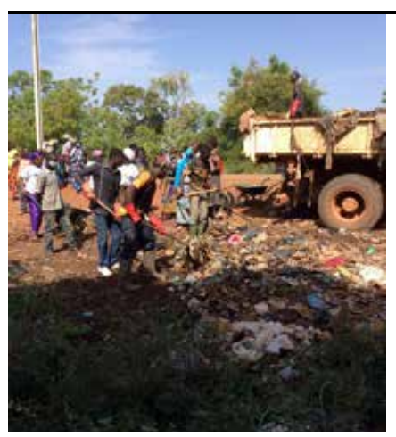
First day of AJSDV regional forum October 20th. Elimination of unctroled dump site with Ouahigouya municipality