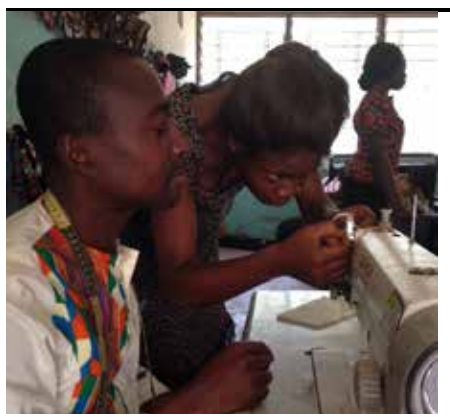
Ghana's EcoShoes staff at the workshop