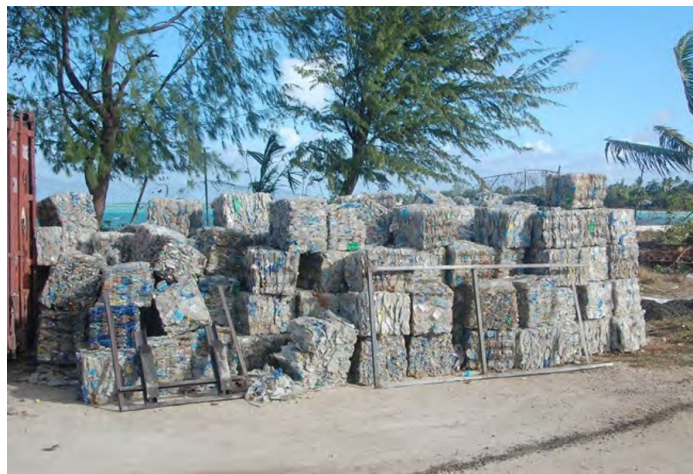
Plastic recycling site, Tarawa, Kiribati.

In the Pacific, the previous waste recycling plant ( i.e. Samoa Recycling and Waste Management Association ) which comprise of local businesses and community groups, in collaboration with the UN Environment Programme, Pacific office and the Pacific Hub is being revived due to its past success in effectively reducing the influx of waste into the marine environment.