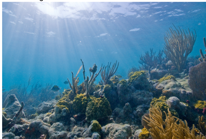
Underwater view of coral reef in the Pacific.

Moreover, the creation of national environmental management strategies in Small Island Developing States (SIDS) like Tuvalu, Vanuatu, with support provided in the review processes in Tonga, Solomon Islands, the Republic of Marshall Islands, among other Pacific Island States are among the achievements of the programme in the Pacific region. The documents brought an integrated approach for the implementation of various MEAs (NBSAPs, National Action Plans for climate change or National Adaptation Programme of Action) and have been particularly successful in tackling environmental challenges in the Pacific Island States. These achievements are being elevated to the next level by the development and deployment of national guidelines to implement NBSAPs as per the Nagoya Protocol and for the implementation of the post 2020 agenda.