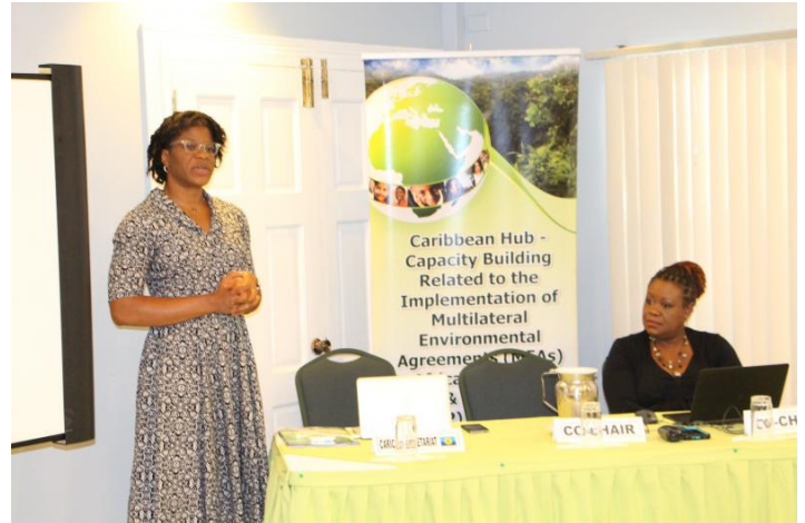
MEAs capacity building and awareness raising workshop.

A similar approach is also being applied in the Pacific on the promotion of synergies and institutional cooperation between biodiversity convention and the relevant daughter agreements of the Convention on Migratory Species on common issues of concern such as Ocean Acidification, Marine Litter and Sargassum.