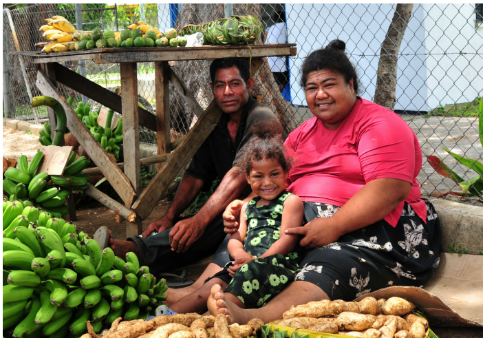
A farming family showcase its produces in Tonga, the Pacific

These interventions build on FAO's previous achievements in the ACP regions where it supported a cross-sectoral approach to the implementation of the CBD by introducing two technical guideline documents for East Africa and the Pacific Islands regions that collect context-specific knowledge and experience on ecosystem-based agriculture while providing policy entry points for mainstreaming at the national and regional levels.