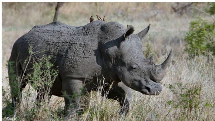
Black rhinoceros walking in a field-one of the endangered species

Biodiversity loss is one of the world's most pressing issues facing humanity. Through this programme, we are supporting ACP countries by strengthening their COPs negotiation skills, developing relevant guidelines, national frameworks, legislations and mechanisms for the effective implementation of the biodiversity cluster of MEAs, which include treaties such as the Convention on Biological Diversity (CBD), Convention on the International Trade in Endangered Species of Wild Fauna and Flora (CITES), and Convention on Migratory Species (CMS), the post-2020 biodiversity framework, as well as supporting governments in creating enabling policy environment and develop transparent procedures to control the illegal trade in wildlife products. The activities are focusing on supporting the effective integration of environmental concerns addressed in the various MEAs into national and regional policies and laws including stakeholders awareness raising.