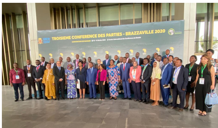
Delegates during the Bamako Convention COP3 in Rep. Congo.

The decisions adopted recommended the provision of information and guidance to member States to promote the ratification of or accession to, and the incorporation into national laws the mechanisms for the implementation of the Convention in order to consolidate actionable efforts to enhance the total ban of the import of hazardous chemicals and wastes into Africa among others. Regional tools and guidelines for the sound management of chemicals and waste in Africa are also being developed in selected member States of the African Union, focusing on decreasing the uncontrolled waste disposal and related negative impacts on human health.