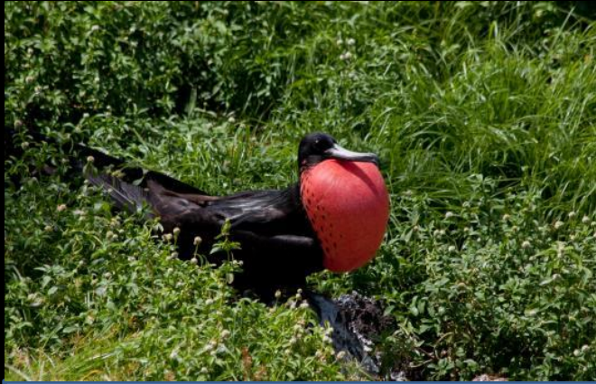
Magnificent Frigatebird : 1 300 breeding pairs (10% Caribbean population)