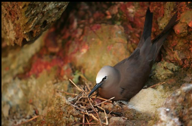
Brown Noddy : 300 breeding pairs