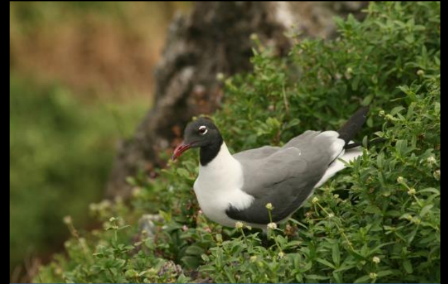
Laughing Gull : 2 500 breeding pairs (20% Caribbean population, southern colony)