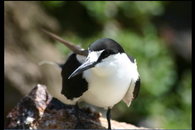
Sooty Tern: 20 breeding pairs