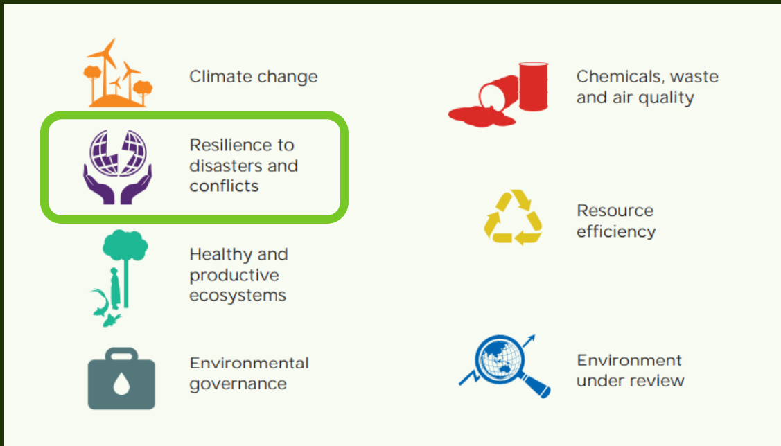
UNEP priority areas for the medium-term strategy for the period 2018-2021