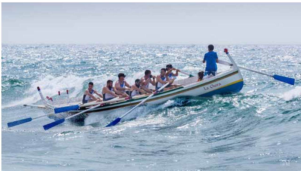
Acting and Delivering as One