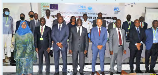
Delegates during the launch of the ACP MEAs 3 Project by Abidjan Convention in Côte d'Ivoire, March 2021

It is estimated at global level that between 5 to 13 million tons of plastic enter the marine environment each year. Hence, there could be more plastics than fish in the oceans by 2050, the participants opined.