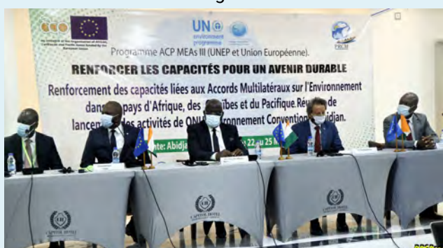
Delegates during the launch of the ACP MEAs 3 Project by Abidjan Convention in Côte d'Ivoire, March 2021

As a regional hub for Ocean governance in the Western, Central and Southern Africa, the Abidjan Convention through the ACP MEAs 3 project is promoting environmental sustainability in the African ACP countries by strengthening environmental governance and the implementation of MEAs. This will be achieved by improving capacities to enforce and apply MEAs related to biodiversity, to chemicals and wastes and to ocean governance.