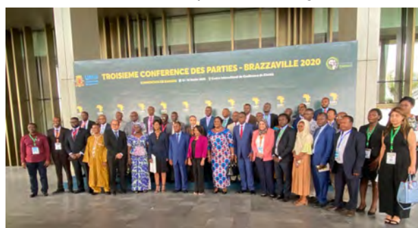
Delegates during Bamako COP3 in Brazzaville, Republic of Congo. Feb 2020

The three-day meeting began with a two-day expert segment on 12 and 13 February where the participants discussed appropriate legal, administrative and other measures to prohibit the import into Africa and control of the transboundary movement of hazardous wastes within Africa, including a new list of substances which have been banned, cancelled or refused registration by government regulatory action, or voluntarily withdrawn from registration in the country of manufacture for human health or environmental reason under paragraph 1(d) of Article 2 of the Bamako Convention. Delegates during Bamako COP3 in Brazzaville, Republic of Congo.