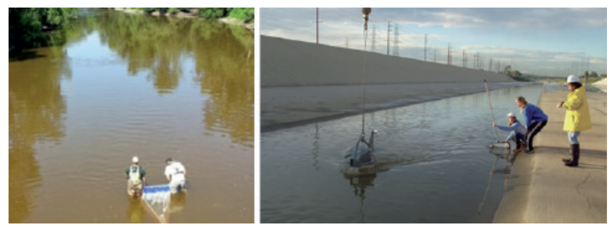
Figure 2. Examples of the use of sampling nets in a wadable river ( left, Baldwin et al. 2016 ) and from the bank and a crane ( right, Moore, Lattin and Zellers 2011 )

Sieving or filtering samples ex situ is generally not suitable for lakes or reservoirs, as a minimum of hundreds of litres of water is needed for reliable quantification of microplastics. There are alternative sampling options if microplastic fibres are of interest. Samples from nets and sieves must be processed on-site, with consideration given to minimizing contamination. To analyse the organic content, the sample should be kept cool (<4°C). Depending on the number of particles in the sample, density separation may also need to be included.