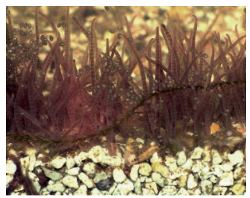
Thunderclap - Eigenes Werk, CC BY 3,0 https://commons.wikimedia.org/w/index. php?curid=6099484