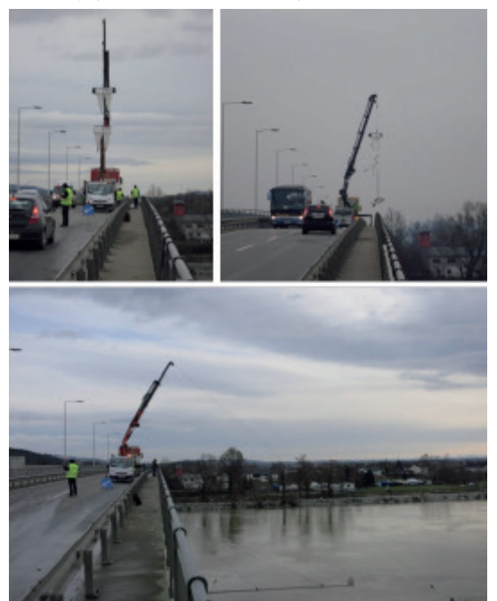
Figure 3. Sampling a large river (the Danube) by crane from a bridge. An array of nets is positioned to sample the water surface and the water columns simultaneously (Hohenblum et al. 2015).

recommended that three cores per site be taken to determine possible variation. If an intact water-sediment interface is not required for other study purposes, a metal box corer can be used. The sediment itself can be recovered undisturbed and subsampled with small tubes.