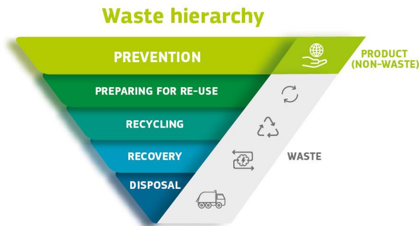
Figure 2: Waste hierarchy

37. Croatia and Turkey have reported a large reduction in the use of plastic bags due to applying a combination of instruments, including charges paid by consumers and plastic bag taxes, voluntary agreements and/ or bans on free distribution of single-use plastic bags. In Croatia, a 65% reduction was achieved since 2010, while as the introduction of a payment for plastic bags has significantly changed consumers' behaviour in Turkey just over a couple of years period, leading to a 75% reduction in the use of plastic bags. The most common marine litter prevention measures found in the countries are extended producer responsibility (EPR), economic/ fiscal instruments and incentives, and deposit refund systems.