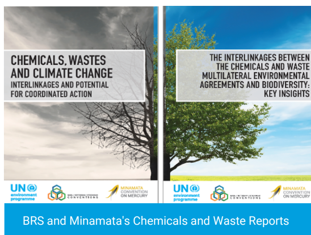
BRS and Minamata's Chemicals and Waste Reports

BRS and Minamata conventions launched two reports on 5th and 21 June 2021 that mapped the interlinkages between hazardous chemicals, wastes, climate change, and biodiversity. The “Chemicals, Wastes and Climate Change: Interlinkages and Potential for Coordinated Action”, presents a comprehensive overview of the interrelations among climate change and hazardous chemicals and wastes management, towards identifying opportunities for a coordinated action that simultaneously address the two challenges of the broader sustainability agenda. The second report on the “Interlinkages between the chemicals and waste MEAs and biodiversity: key insights” is inspired by the ongoing discussions of a post-2020 global biodiversity framework that illustrates the interlinkages between the work of the four global chemicals and wastes conventions (Basel, Rotterdam, Stockholm, and Minamata) and the convention on biological diversity (CBD) and other biodiversity-related conventions.