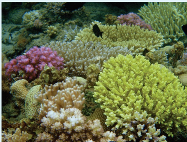
A health coral reef ecosystem in the Western Indian Ocean.

the Nairobi Convention has initiated the revision of the protocol to ensure its legal framework is strengthened to make it more effective at conserving biodiversity, managing marine, and coastal ecosystems, and addressing current and emerging threats. The final report of the protocol will be presented to the contracting parties during the next Conference of Parties of the Nairobi Convention, to be held in mid-November 2021.