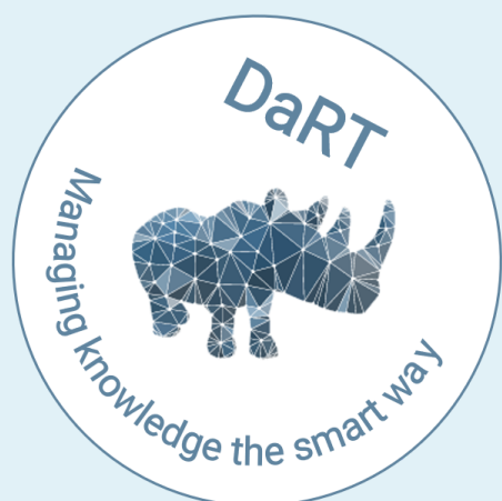
Data Reporting Tool.

Ministries and administrative units in one national working space, enhancing synergies across conventions and increasing the effectiveness of national efforts to achieve global environmental targets.