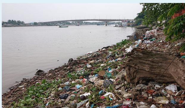
Plastic waste overflowing in Cambodia's Mekong, one of the world's most polluted rivers.

meetings took place for the Asia-Pacific, Africa, Eastern Europe, and Latin America, and the Caribbean regions in May-June 2021. The objective of the online regional meetings was to give Parties in those regions the possibility to hear briefings, exchange views, and consult each other on the items of the provisional agendas of the respective meetings of the COPs that are expected to be considered during the online segment. An approximate total of 437 participants took part in the online regional meetings representing a total of 131 country Parties and 28 observers.