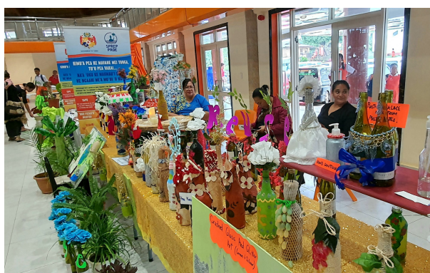
Tonga Environment Week.

In Samoa, the ACP MEAs 3 celebrated World Biodiversity Day in collaboration with the Government of Samoa through its Ministry of Natural Resources and Environment, the Samoa Conservation Society, and SPREP. Commemorating the “We are part of the Solution” theme, an open invitation to the local communities in Samoa to visit the Malololelei Recreation Reserve for an interactive tour of the grounds highlighting the work done to protect and conserve species in the reserve. The Malololelei Recreation Reserve was established in 2015 and is home to rock formations that are approximately three million years old, as well as a number of globally threatened IUCN Red listed species including at least five endemic birds.