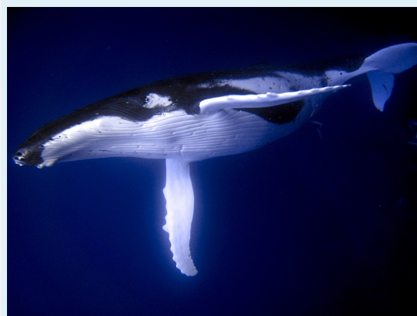
Whales, Protection of Life Below the Sea

A webinar on addressing the needs and special circumstances of Small Island Developing States (SIDS) in the future BBNJ instrument was co-hosted by the Chairs of the Alliance of the Small Island States (AOSIS), Pacific Islands Forum Secretariat (PIFS), and the Pacific Small Island Developing States (PSIDS) where SPREP presented to national and permanent mission representatives from SIDS. Knowledge and sharing of experience are critical for achieving sustainable environmental governance. Hence, the webinar featured Pacific and Caribbean experiences in terms of implementation of SIDS provisions from existing multilateral environmental agreements/instruments and explored potential mechanisms for implementation and funding BBNJ within SIDS.