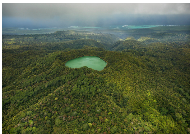
Lake Lanoto'o Ramsar Site_Samoa

coming CBD meetings with inputs from Parties and other stakeholders. SPREP through the ACP MEAs 3 programme supported the Pacific delegates on the virtual participation in the 24th Subsidiary Body on Scientific Technical and Technological Advice as well as the SBI 3 meetings of the CBD with access to an internet connection to facilitate their virtual participation in the meetings.