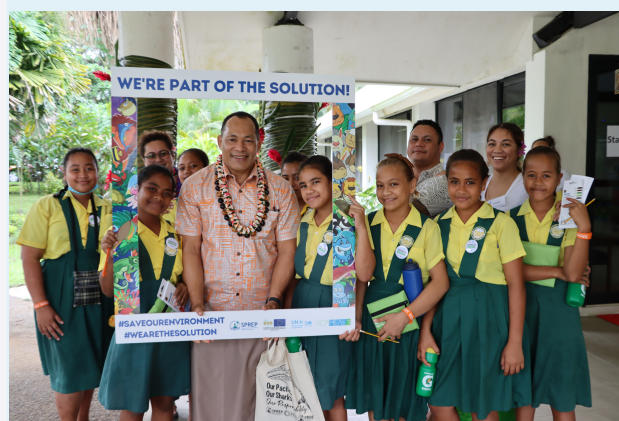
SPREP Director General with students from Siumu Primary School.

The Secretariat of the Pacific Regional Environment Programme (SPREP) celebrated its 28th Anniversary in June with an Open Day that saw over 150 students, teachers and members of the Diplomatic Corp hosted for an interactive tour. Environment stations were established for the school students to visit and participate in a range of learning activities. Ensuring intergenerational and inclusive participation of youth, a virtual component was also included for this event which saw students from American Samoa, Marshall Islands, Solomon Islands, and Vanuatu participate. "We're part of the solution" was the theme for the event that saw students participate in a number of interactive stations learning about biodiversity, climate change, environmental governance, waste management, and the corporate aspects of an environmental organization.