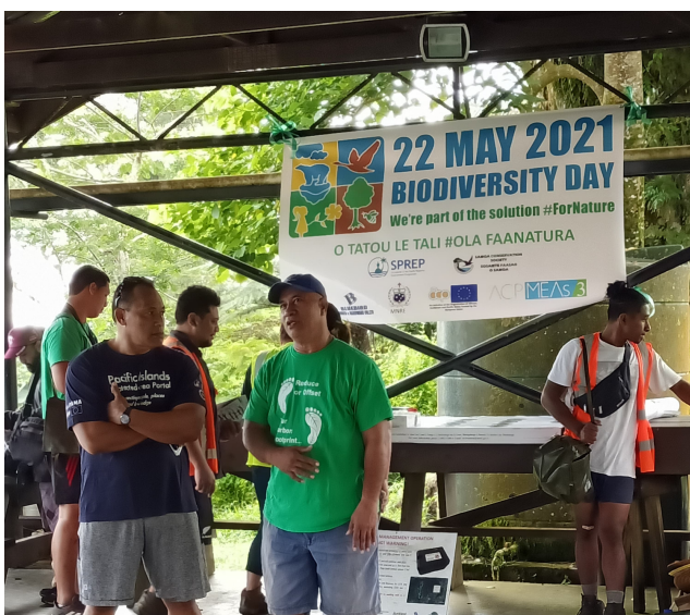
Biodiversity Day in the Pacific.

Improving the understanding of Pacific Islanders about the richness of their biodiversity particularly the least understood Soil biodiversity is an important topic for the region. In May 2021, the Food and Agriculture Organization, in collaboration with the Pacific Community and SPREP held a virtual preparatory thematic session that brought experts from the Environment and Agriculture sectors together to discuss specific key issues, priorities, and needs to conserve soil biodiversity in the Pacific islands. The session helped the Pacific prepare as the world moves towards a new global framework to halt biodiversity loss under the CBD.