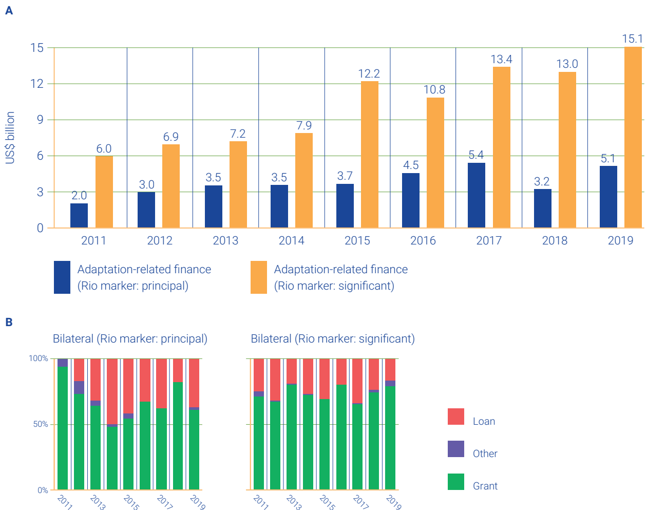
Figure 4.2 Panel A: Adaptation-related bilateral flows to developing countries between 2011 and 2019 Panel B: Share of financial instruments used per year for principal and significant markers

Note: Data represent donor commitments and are in constant US$. Data include both adaptation and cross-cutting finance (22 per cent for activities targeting both adaptation and mitigation). Loans are presented at face value. Data include both Annex II and non-Annex II countries. A full list of funders is provided in Annex 4.C [online] . The contribution of Annex II is over 97 per cent of the totals shown for both the “principal” and “significant” markers.