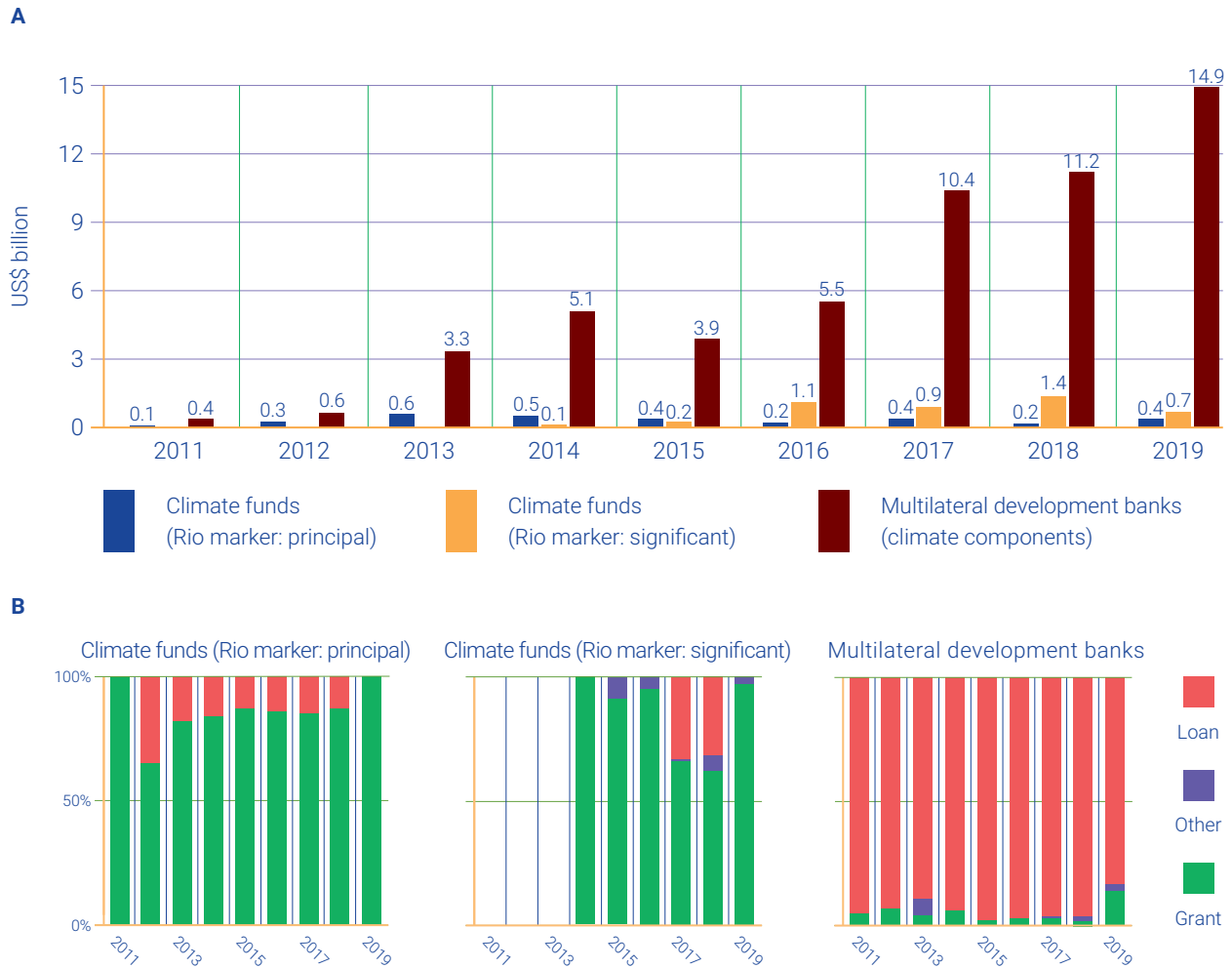
Figure 4.3 Panel A: Adaptation-related multilateral flows to developing countries between 2011 and 2019 Panel B: Share of financial instruments used per year for climate funds (principal and significant markers) and multilateral development banks

Note: Data represent donor commitments and are in constant US$. Data include both adaptation and cross-cutting finance (targeting adaptation and mitigation at the same time). Amounts are presented at face value. Data providers use different methods: MDBs use Climate Components; multilateral climate funds use Rio Marker (Annex 4.C [online]). Multilateral climate funds are the Adaptation Fund, Climate Investment Funds (Strategic Climate Fund), the Global Environment Facility (Least Developed Countries Fund, Special Climate Changes Trust Fund, General Trust Fund), the Green Climate Fund. MDBs included in this data are the African Development Bank, the Asian Development Bank, the Asian Infrastructure Investment Bank, the Caribbean Development Bank, the Development Bank of Latin America, the European Bank for Reconstruction and Development, the European Investment Bank, the Islamic Development Bank, the International Finance Corporation, the Inter-American Development Bank Group, and the World Bank Group.