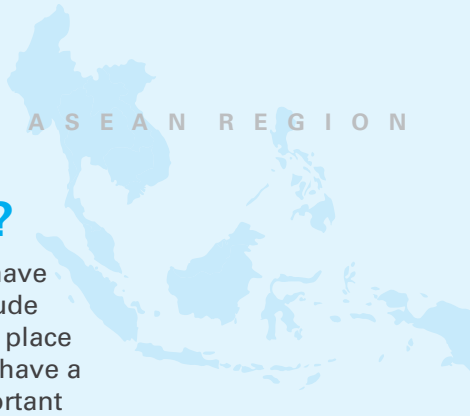
A S E A N R E G I O N