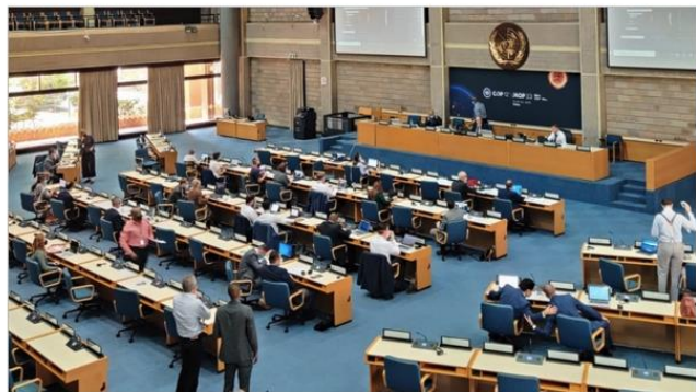
Environmental experts meet to plan the next UN Environment Assembly