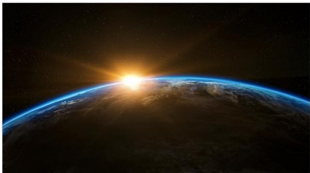
UNEP to celebrate 50 years of work in 2022