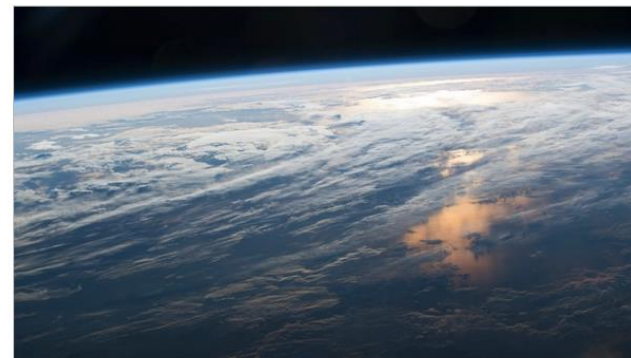
Rebuilding the ozone layer: how the world came together for the ultimate repair job