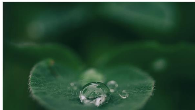
UNEP@50: Reflecting on the past, envisioning the future