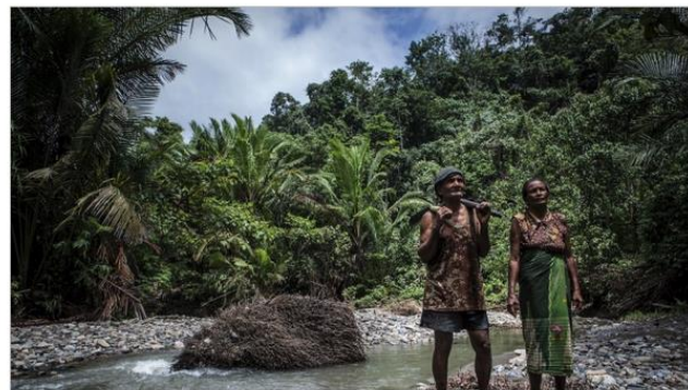
Inside the global effort to save the world's forests