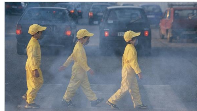
Inside the 20-year campaign to rid the world of leaded fuel