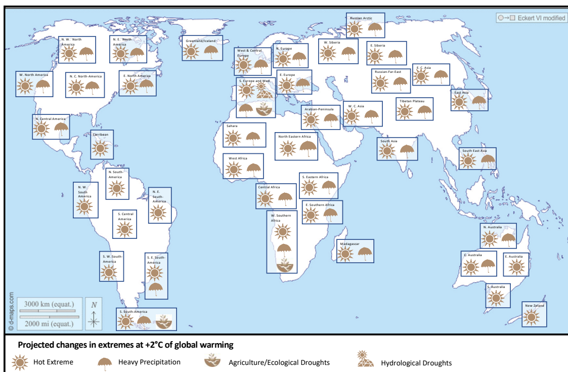
Figure 2: Projected changes of extreme events at +2°C of global warming. Projections are shown for the pre-industrial baseline 1850-1900. Only projected changes with a high level of confidence are represented. Source: AR6 WG1 IPCC report, chapter 11, table A.11.2, pp 17-19. 7

However, there is a great disparity in risk knowledge and response capacity among countries and regions in terms of responding to both sudden-onset and slow-onset events, as well as cascading risks. Knowledge needs to go beyond the provision of extreme weather, climate and water-related alerts to include information about trends in events, locations of climate hazards, types of associated impacts, who and what are likely to be affected, and how to be prepared.