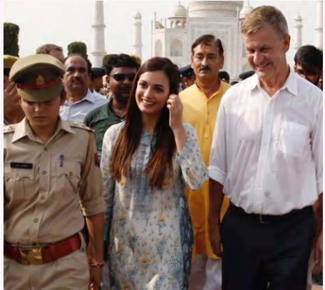
One hundred of India's historic monuments, including the iconic Taj Mahal, will become Ø litter-free.