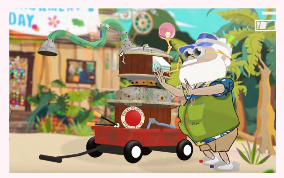
Bottle Island, a preschool adventure TV series, created a special mini-episode for World Environment Day, which received more than 84,000 views in a week.