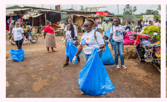
More clean-ups took place across Burundi, Cameroon, Côte d'Ivoire, China, Albania, Algeria, Bahrain, Haiti, Mexico, Uruguay, Morocco, Myanmar, Ethiopia, Tunisia, South Africa, Lebanon, Kazakhstan, Montenegro, Zambia and Kenya.