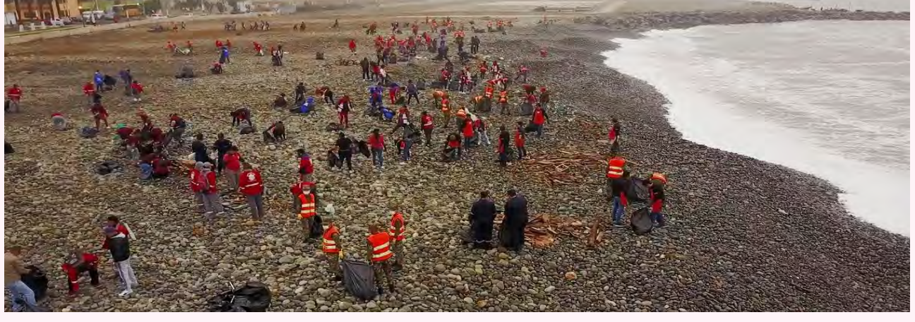
Over 1,000 people gathered to clean up Carpayo beach, Lima.