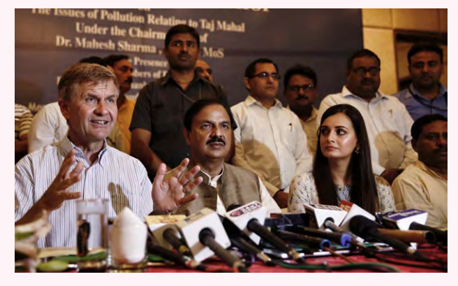
Indian Culture and Environment Minister Mahesh Sharma Ø announced the formation of advisory committees for environmental protection of monuments.