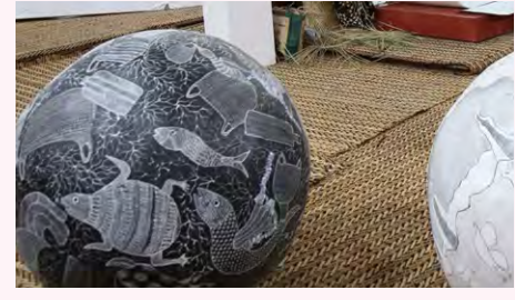
Tribal artists from various traditions collected plastic waste from their communities to create beautiful. thought-provoking tribal paintings and sculptures.