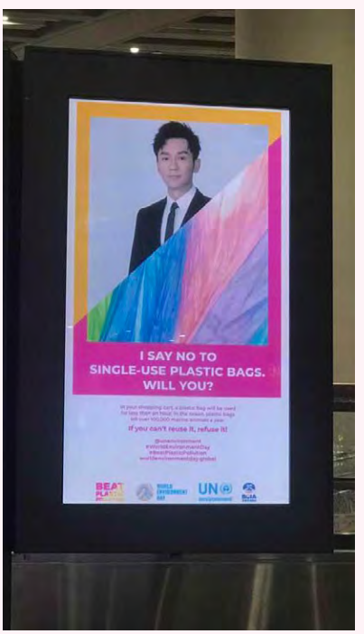
Art exhibitions were on display throughout China including at the Beijing Museum of Urban Planning, Beijing Capital International Airport and Sinan Mansion Plaza. China Daily's video on Weibo on the launch event at the Museum of Urban Planning got more than one million views.