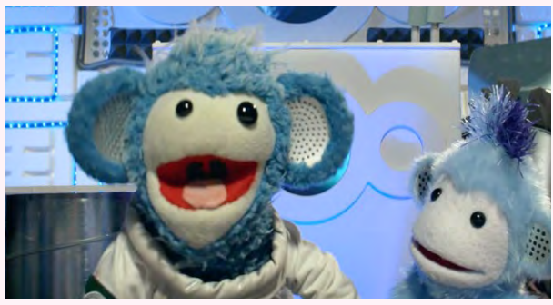
Wastebuster's Plastic Planet Challenge invited young people from across the globe to beat plastic pollution, reaching 1.3 million people from 16 countries in four days.