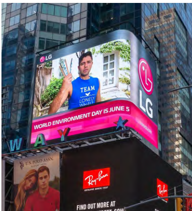
A #BeatPlasticPollution video was screened on billboards in Times Square, New York, Piccadilly Circus, London, and across Victoria Harbor in Hong Kong.

UNESCO distributed the education toolkit in English, French and Spanish to 26,000 schools in 182 countries through the UNESCO Associated Schools Programme.