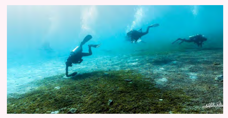
Underwater clean-ups were organized in Egypt, Bahrain and Tanzania.