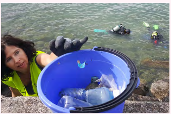
Clean-ups took place at 11 European lakes, from Lake Baikal in Russia to Lake Como in Italy.