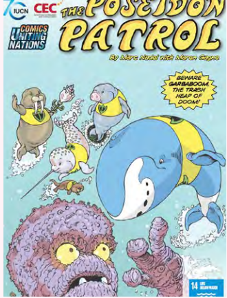
Other efforts to reach children with important lessons on how to beat plastic pollution included the comic Poseidon Patrol and a special episode of BBC's Go Jetters.