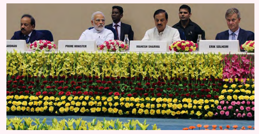
As global hosts to World Environment Day 2018, India put on a historic display, marked by unprecedented commitments and record engagement across the country. Ø