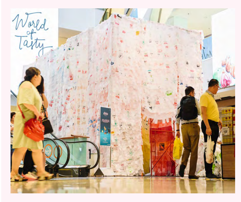
Art exhibitions were unveiled across 12 major cities in Asia Pacific. The plastic pollution "demon" in Bali made it to the front page of the Jakarta Post. In Bangkok, all major print media covered a display in a mall with up to 150,000 visitors daily, as part of a three-day event.