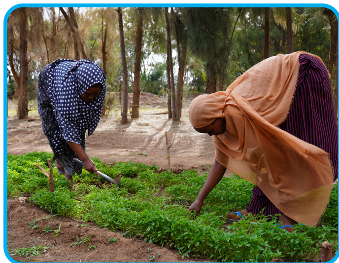
Fig 3: The nursery site in Fafan zone

Key implementing partners: Ethiopian Red Cross, Wetland International, Cordaid, the regional and woreda/district level Agricultural and Natural Resources Offices, GIZ, and Jigjiga University.