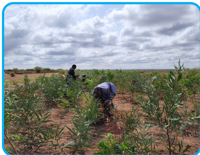
Fig 4: The Rangeland in Fafan zone