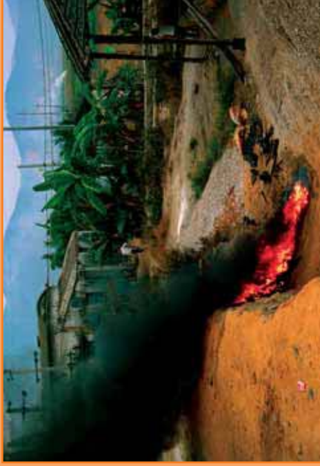
Open burning of wires and other parts are common to recover metals such as steel and copper. Dioxins and furans can be expected due to the use of PVC and brominated flame retardants.

(polybrominated biphenyls (PBB) or polybrominated diphenyl ethers (PBDE)) in new electrical and electronic equipment put on the market from 1 July 2006.