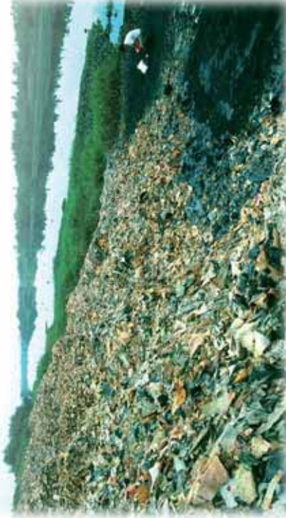
BAN investigator taking a soil sample along riverside where circuit boards were treated with acid and burned openly. Massive amounts of dumping of imported computer waste takes place along the riverways. Guiyu, China.

The recycling and disposal of computer waste in these countries becomes a serious problem since their treatment methods remain rudimentary. Such activities pose grave environmental and health hazards; for example, the deterioration of local drinking water which can result in serious illnesses. A river water sample from the Lianjiang river near a Chinese "recycling village" revealed lead levels that were 2 400 times higher than