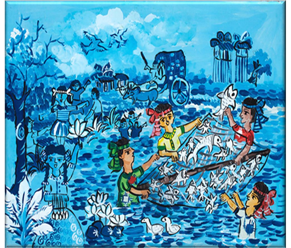
2018 World Habitat Day Children's Drawing Competition Children's Future Award