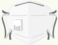
Figure 3: Basic disposable face covering

If a full-face mask is not available to those needing to clear debris containing or potentially containing ACM, then a face mask covering nose and mouth should be used. Figure 2 shows a reusable mask (applicable standard EN140 with P3 filter), covering nose and mouth, which would be suitable for those working for regular periods in debris clearance.