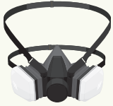
Figure 2: Reusable face covering

For long periods of continuous use in demolition related works, effort must be made to use the highest level of mask available and practical in the circumstances. Figure 1 shows the type of mask, covering the whole face, which should be used by those working significant amounts of time with or in close proximity to ACMs. Full face masks should conform to BS EN 136 standard with P3 filter and should be used by licensed operators.