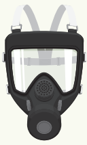
Figure 1: Full face covering