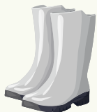
Figure 5: Wellington boots

Should one of the masks shown in Figure 3 or Figure 6 be used, then it is recommended that safety goggles are used, meeting BS EN 166 standard) as shown in Figure 4.