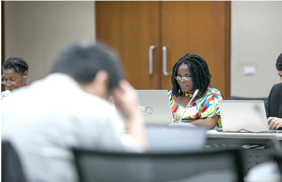
IMAG member during the meeting

Some of the key points from the meeting include: