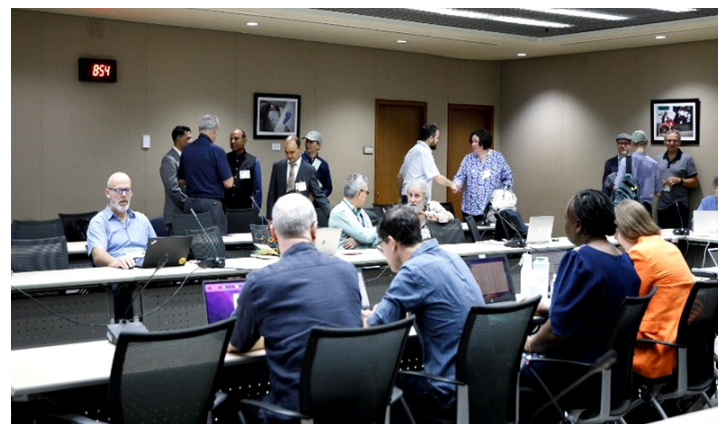
Modelling workshop participants

The workshop highlighted the purpose of the Outlooks section. GEO's outlook section seeks to explore environmental and socioeconomic implications of different routes: in the absence of new policies; and under scenarios where specific environmental targets are being achieved. The development of target-seeking scenarios requires models and storylines. The workshop gave a detailed description