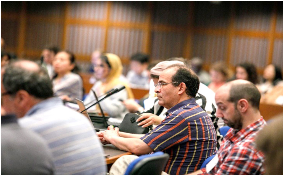
Participants at the GEO-7 meeting

In these brainstorming sessions, authors were able to expand the annotated outline and begin developing a draft of the chapters of GEO-7. On the final day of the meeting, the groups presented the achievements made in the week, the gaps in expertise identified within their author teams, the workplan towards the June and September on-line meetings and the production of a first-order draft by January 2024. The GEO-7 timeline can be found here . The outcomes document can be found here .