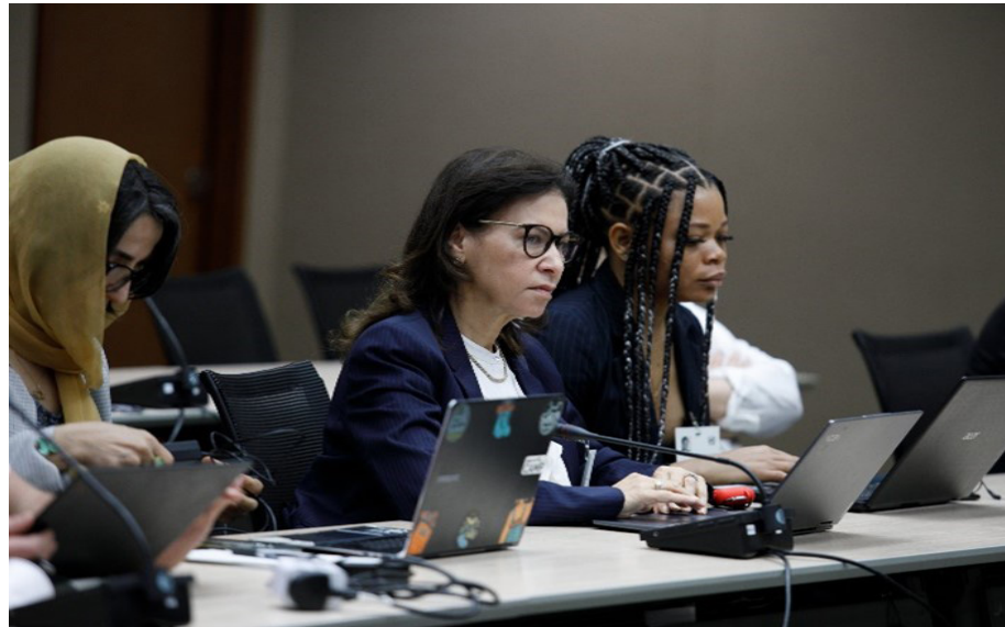
Some MESAG members during one of the sessions