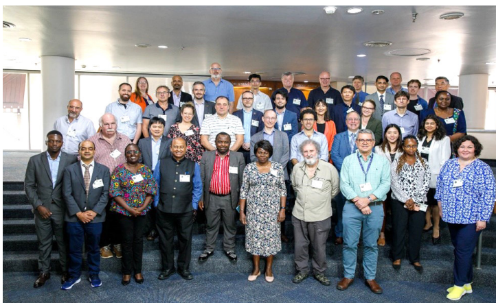
Group photo of the workshops participants

Modelling and Scenarios and Policy Responses and Solutions Pathways Workshops of the Seventh Edition of UNEP's Global Environment Outlook (GEO-7), 8-10 March 2023.