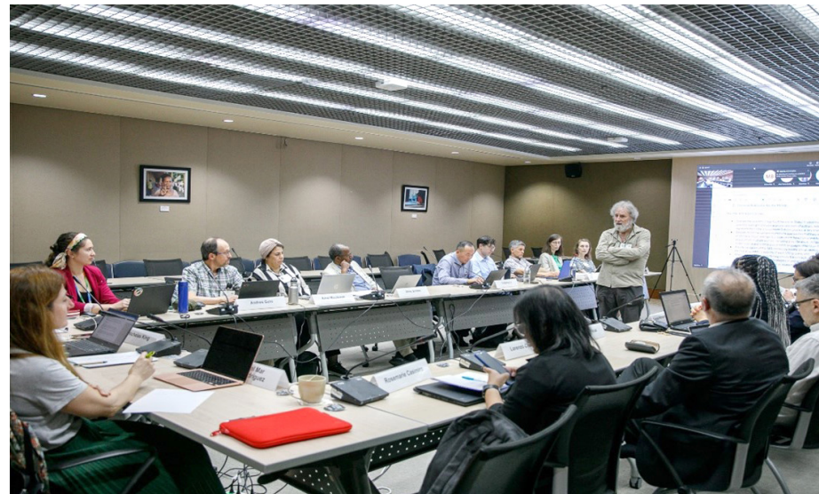
MESAG Members during a session with the one of the Assessment Co-chairs