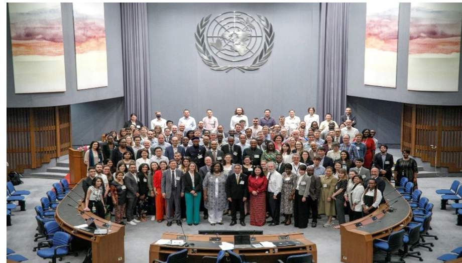
Participants at the First Global Authors Meeting

From the third to fifth days of the meeting, the authors separated into parallel sessions as per the four sections of the report: Overview and Context , State and Trends of the Environment , Policy Responses and Solutions Pathways and Outlooks .