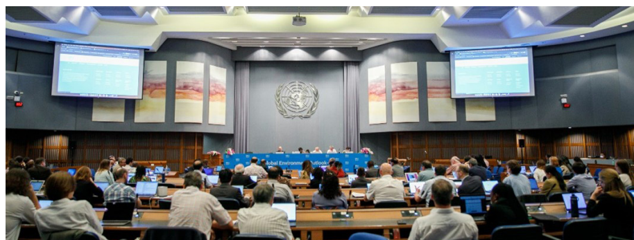
Experts at GEO-7 meeting

The outcomes document of this meeting can be found here .