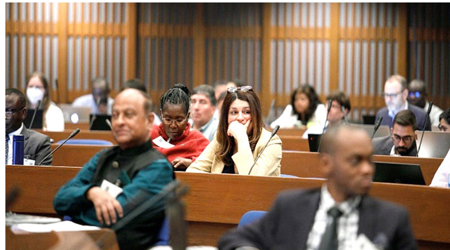
Experts in Bangkok

Following the Bangkok meeting, the need to integrate Indigenous and Local Knowledge throughout GEO-7 was raised, therefore, a call was issued to over 70 experts with expertise on Indigenous and Local Knowledge (ILK). The importance of the inclusion of ILK had also been reiterated by the Inter-governmental and Multi-stakeholder Advisory Group [IMAG] and Multi-stakeholder Expert Scientific Advisory Group [MESAG] . UNEP contacted experts in the field based on their experience in current leading global assessments. The call was made in order to bring together regionally and gender balanced experts to cover ILK in the assessment on two fronts: 1. The systematic integration of ILK into the assessment; and, 2. The selection of authors/ reviewers to support the development of content. Following this call of experts, UNEP received expressions of interest from 12 ILK experts. The co-chairs of the assessment will review their nominations before the final selection of the authors.