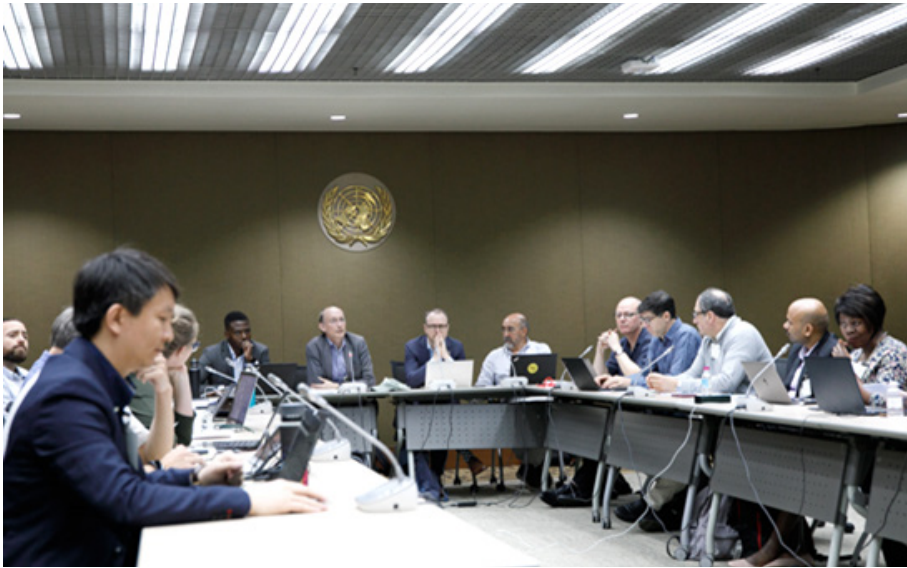
Participants at the Solutions Pathways Workshop

presented in the GEO-7 scoping document . One of the outcomes of the workshop included a working definition of a solutions pathway and it was agreed that policies were not enough, and the definition should include ‘actions’ which would also need to be defined. Further discussions highlighted that actions would be a combination of policies or actions at the business level or society level which would either promote the way to get to the goals or eliminate barriers.