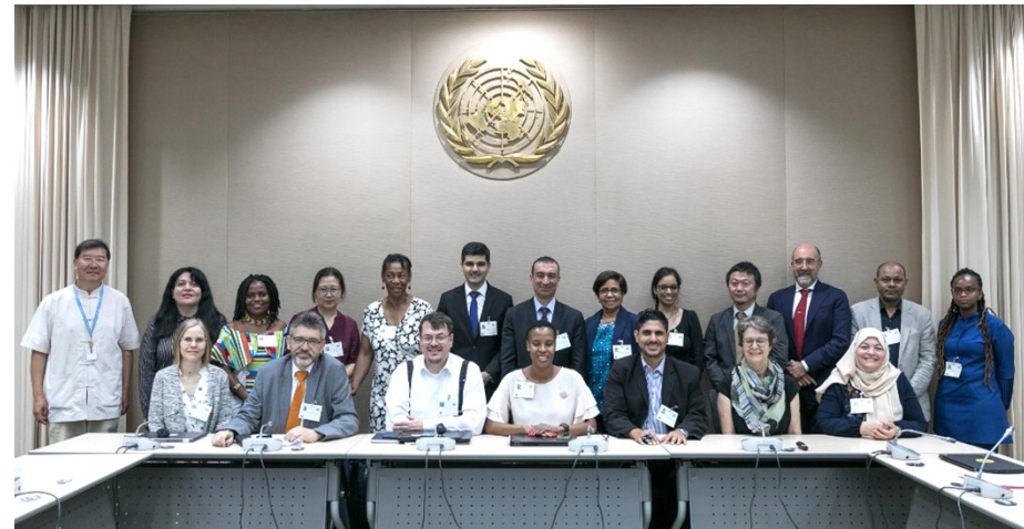
Members of the GEO-7 IMAG

The first day of the meeting began with a summary of the GEO-7 funding. The briefing covered three parts: overall funding of UNEP and the resource mobilization strategy, challenges, successes, and opportunities and lastly the current situation and funding for GEO-7. The second and third days of the meetings covered various discussions on the objectives of the meeting emphasizing on GEO-7 policy questions, the status of the authors based on gender and geographical distribution as well as the selection of collaborating centres amongst other key objectives.