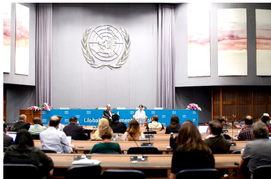
Experts at the side event

At the authors meeting in Bangkok, a side event titled “Energy transition and natural resources – global and regional discussions” was organized. The event focused on the role of the Asia Pacific region in the transition to sustainable energy systems, proposed actions to reach this goal including examples from other countries expanding the conversation to the importance of critical minerals for the energy system. The event explored the key elements to be considered for a transition to more sustainable energy systems and proposed actions to reach this goal.