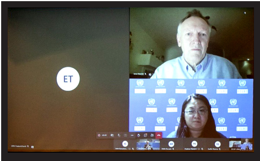
Energy experts dialogue