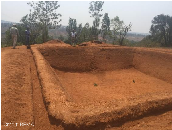
Excavation for installing the water reservoir, located 500m away from the Murago wetland.

When crops fail during drought years, the food cultivated adjacent to - and within - Murago wetland is sold in the market and supports local communities in difficult times. With the aim of protecting the wetland and restoring its degraded parts, the project delineated buffer zones around the wetland and required farmers to vacate these zones, which were previously used for vegetable plots. To ensure these newly-located farmers still have access to water for their crops, a solar-powered small-scale irrigation system was developed to cover 10 hectares (later extended to 34 hectares). The irrigation system draws water from the wetland up to reservoirs constructed on elevated areas. By the force of gravity, the water is then channeled down to small vegetable plots.