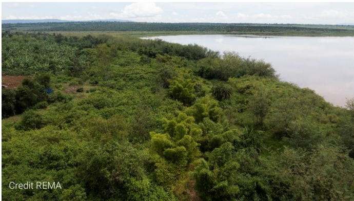
The forested shores of Kibare lake.

Finally, an Environmental and Social Safeguards expert was recruited to join the REMA Single Project Implementation Unit (SPIU) in early 2023. They will be in charge of reviewing the implementation of the safeguards-related recommendations, and identifying and monitoring follow-up actions to be undertaken following project completion.