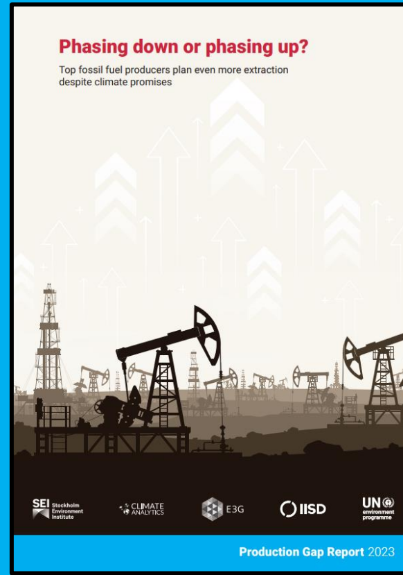
14:15-14:45 Production Gap Report