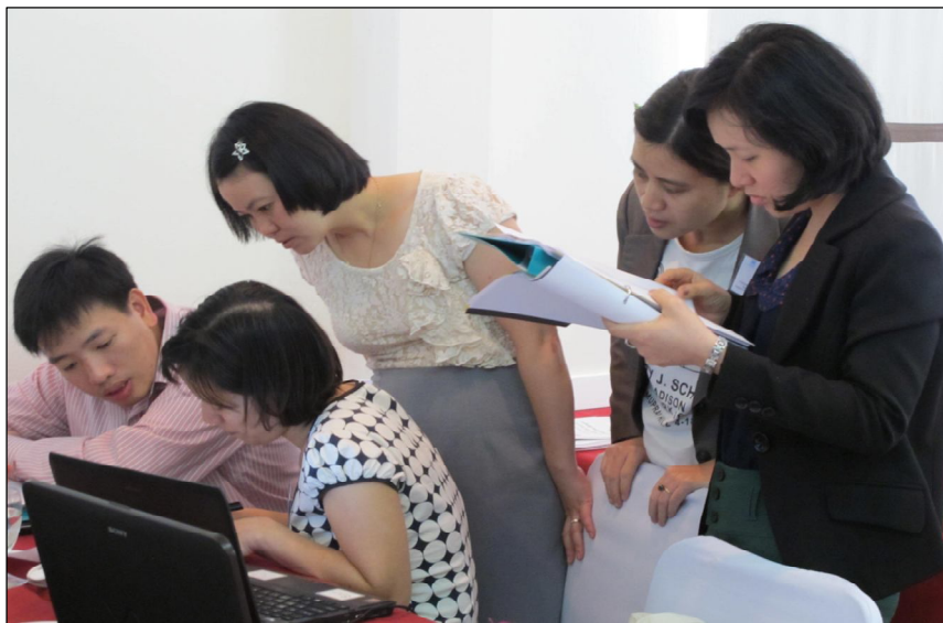
Viet Nameese participants