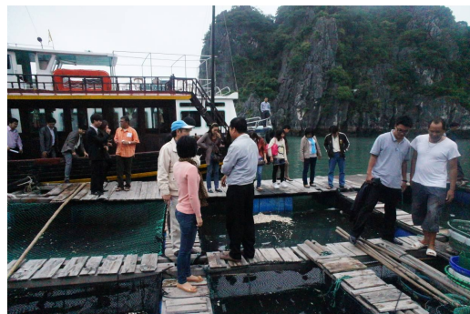
National Training Course on Coastal and Marine Spatial Planning in Viet Nam Hai Phong, 27.Nov – 2.Dec. 2012