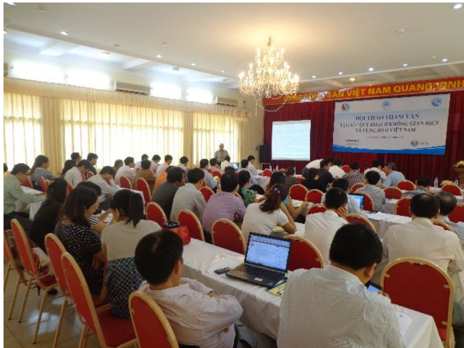
National Consultative Workshop in Hanoi, 23, Oct. 2012