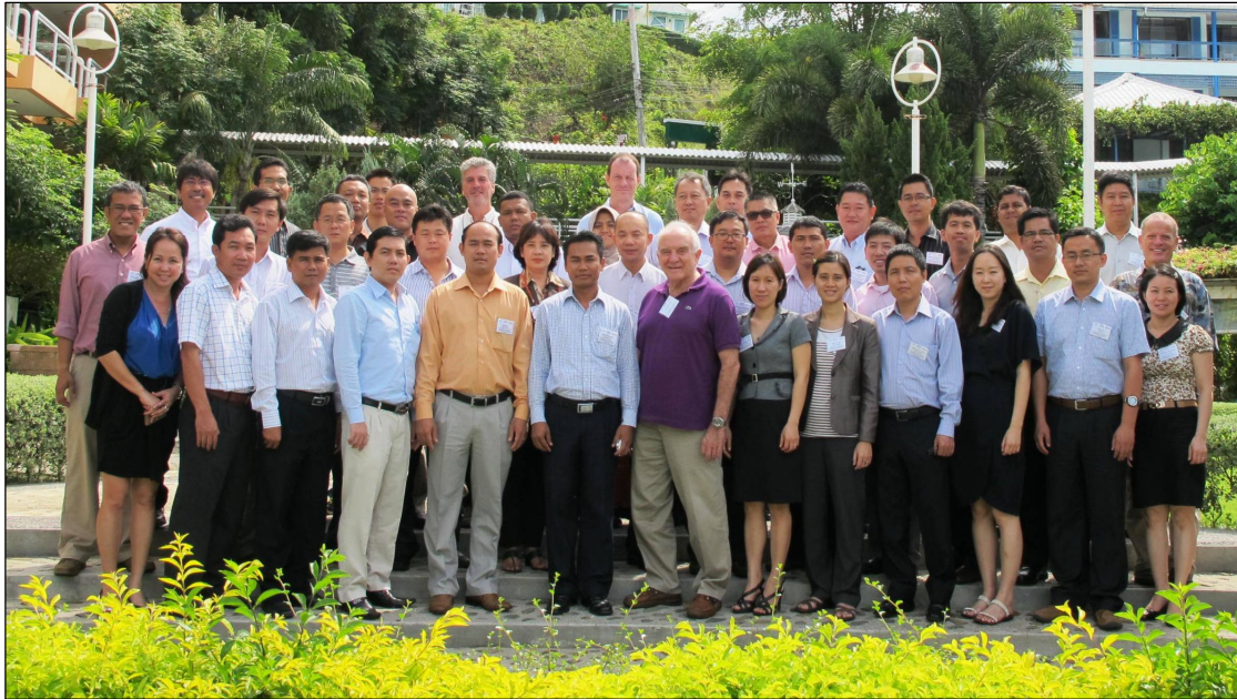
Regional Train the Trainer Course on Coastal Spatial Planning (14-18 May 2012, Phuket, Thailand)