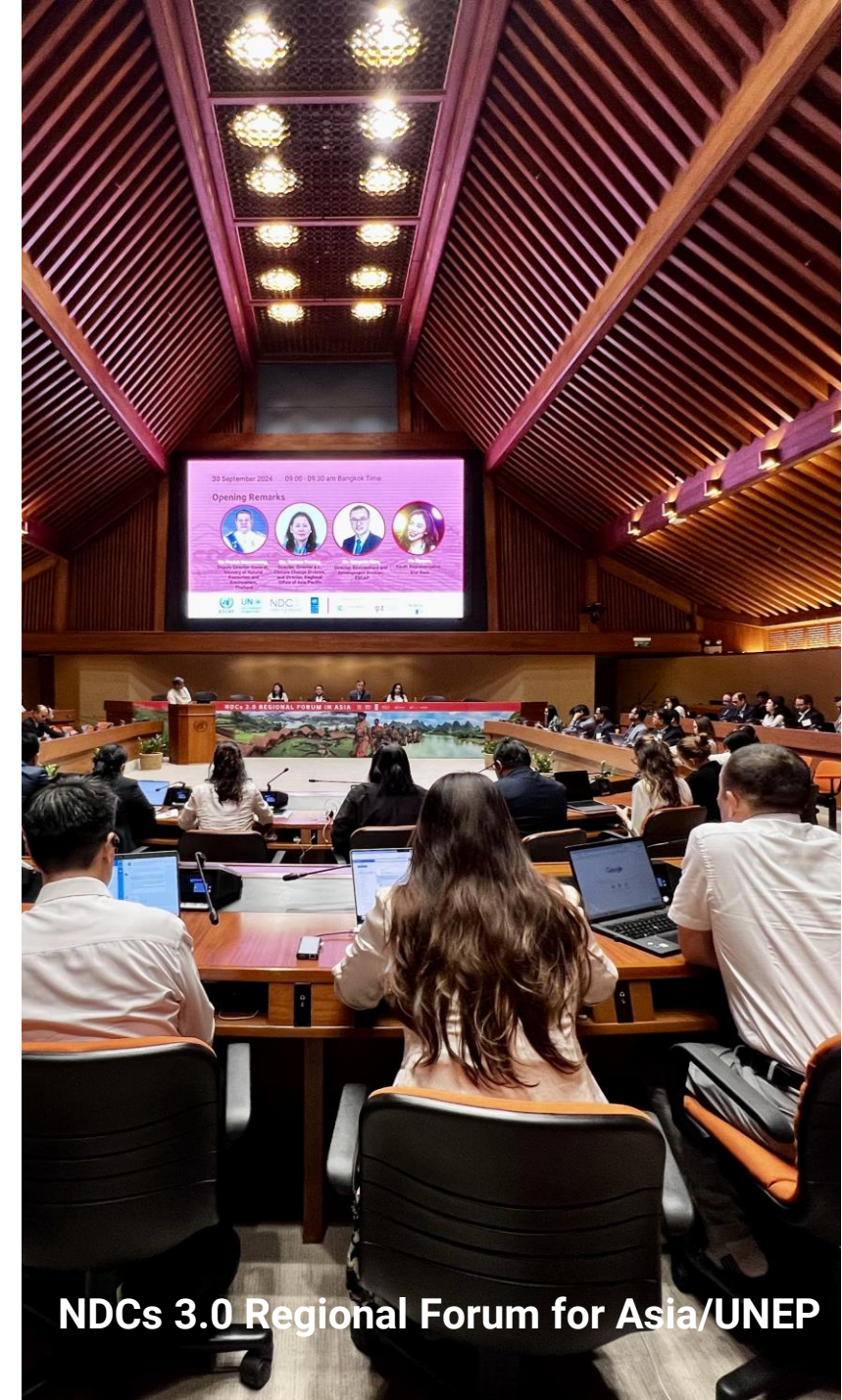
NDCs 3.0 Regional Forum for Asia/UNEP