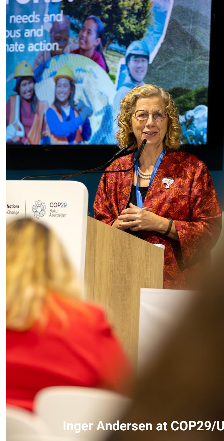
Inger Andersen at COP29/UNEP

E: Promote UNEP's work with Non-State Actors , including with sub-national governments and philanthropies.