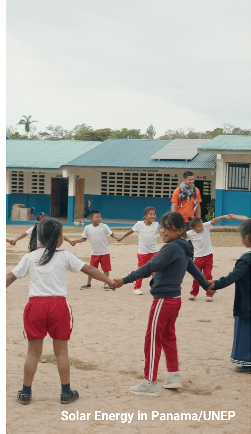
Solar Energy in Panama/UNEP