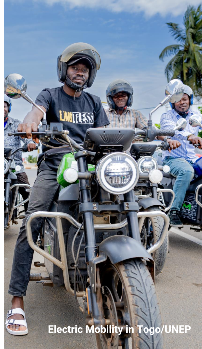
Electric Mobility in Togo/UNEP