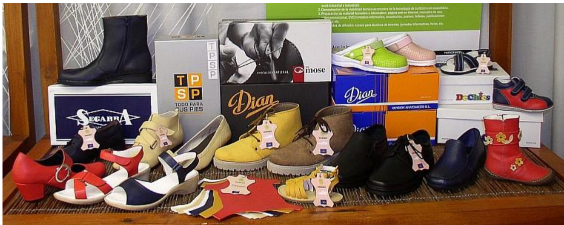
Figure 2. Footwear samples manufactured with oxazolidine leather

3) EU Project “ Demonstration of clean technologies in tanning processes in Egypt (LIFE04 TCY/ET/000045 - ECOTAN)” aiming to boost the environmental Egyptian capacities for the tanning sector. The main results were: