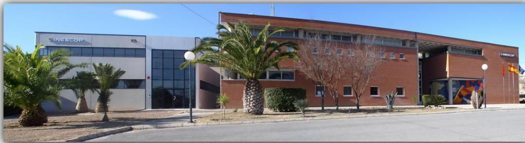
Figure 1. INESCOP's Headquarters in Spain

INESCOP, the Spanish Footwear Technology Institute, is an independent service organisation. INESCOP began its activities in 1971 and works as a private non-profit making organisation.