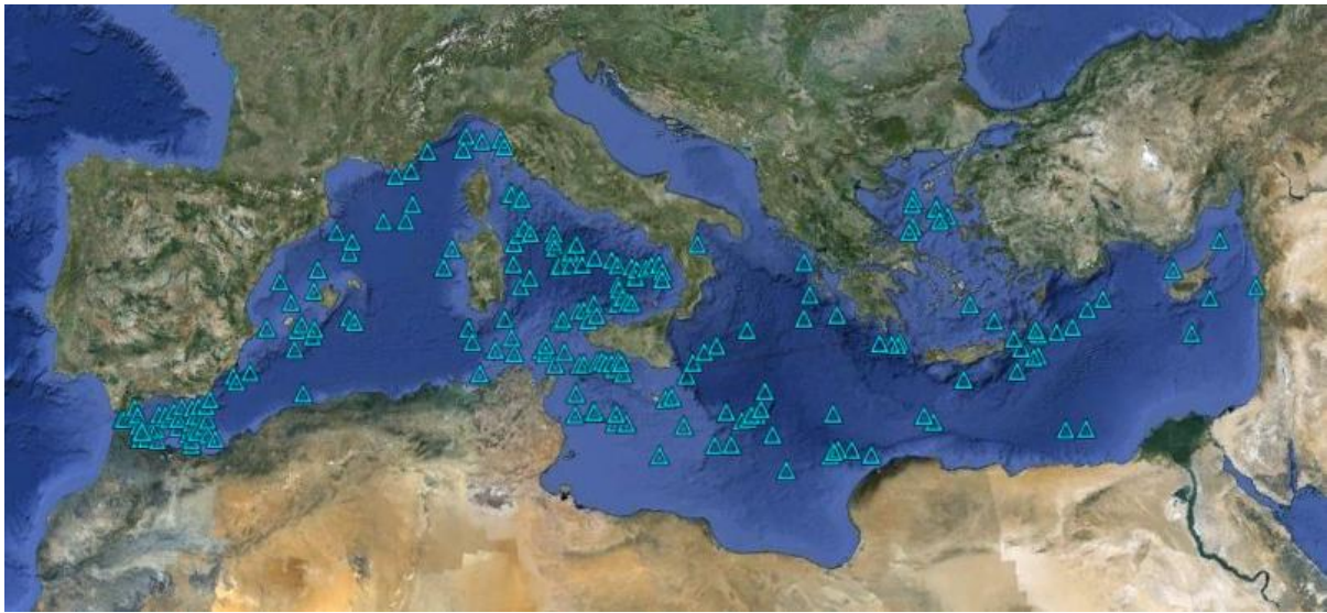
Figure 4: Distribution of the main Mediterranean seamounts

At present, these seamounts are little taken into account in terms of conservation since only that of Eratosthenes (eastern basin) has since 2006 been included as a restricted fishing area by GFCM [3].