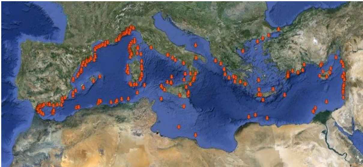
Figure 1: Distribution of main canyons identified in the Mediterranean (after authors of Document & [3], [6]).