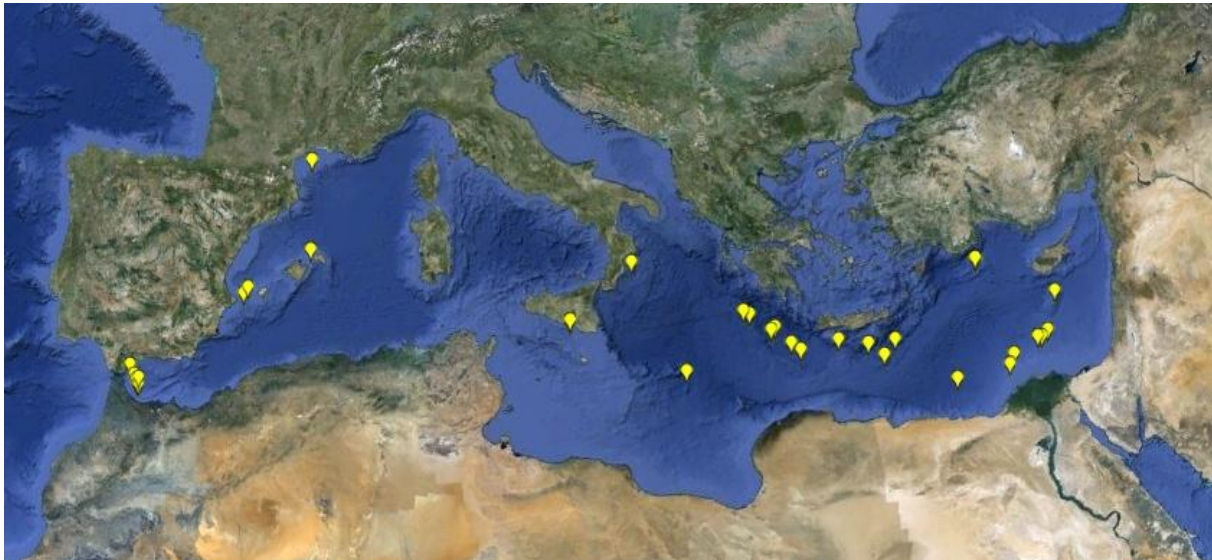
Figure 3: Locating chemo-synthetic populations that have been studied in the Mediterranean (after authors of Document & [6], [12], [13], [14], [15]). Map: Google earth©

'Cold seeps' seem to be well represented along the Mediterranean fold (eastern basin; Figure 3). 'Mud volcanoes' are frequent in the eastern basin especially at the level of the Mediterranean fold and in the south-east of the basin, but the discovery of 'pockmarks' around the Balearic Islands allows us to envisage their existence in the western basin (Acosta et al., 2001, in [12]; Figure 3). Lastly, six hyper-saline anoxic lakes have been localised at the level of the Mediterranean fold [4] (Figure 3).