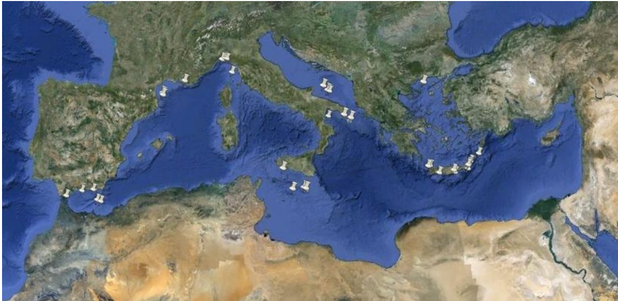
Figure 2: Location of some populations of structuring invertebrates in the Mediterranean. These are mostly 'deep water corals' (after authors of Document & [8], [9], [10]).

Their presence can thus be a necessary precondition for setting up specific measures. Although at present they are still not much taken into account in terms of conservation, since only the Santa Maria de Leuca reef with Lophelia and Madrepora has since 2006 been included as a restricted fishing area by GFCM [11], they are at the origin of the creation of MPAs (e.g. the Cassidaigne and Lacaze-Duthiers canyons, France). Similarly, two sites have been chosen to this effect by Italy (Continental slopes of the Tuscan Archipelago and Santa Maria de Leuca sector) for setting up the Natura 2000 at-sea network, and many are included in the proposal to set up a representative MPA in the Sea of Alboran [6].