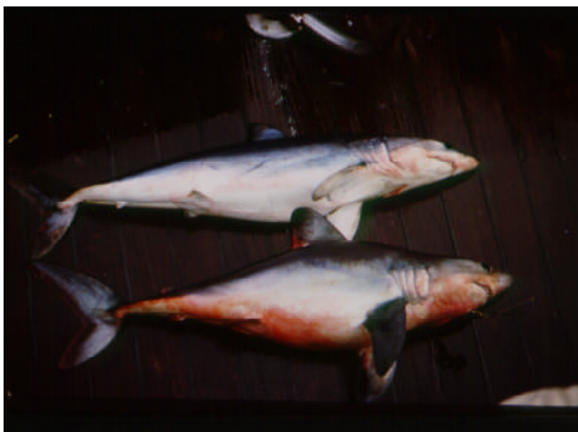
Long line, a potential danger for several chondrichthyan species. Lamnid sharks: juveniles of Isurus oxyrinchus (above) and Lamna nasus (below).

Mediterranean fisheries are not exceptions in the context of the general decline of elasmobranch populations and their related fisheries around the world. The history of shark fisheries indicates that intensive fisheries are not sustainable and that complete collapses of fisheries are not rare. In the case of chondrichthyans, it seems that increased survival of juveniles rather than increased fecundity provides greater resilience to fishing pressure (Brander, 1981), highlighting this as the key factor for the conservation of these species.