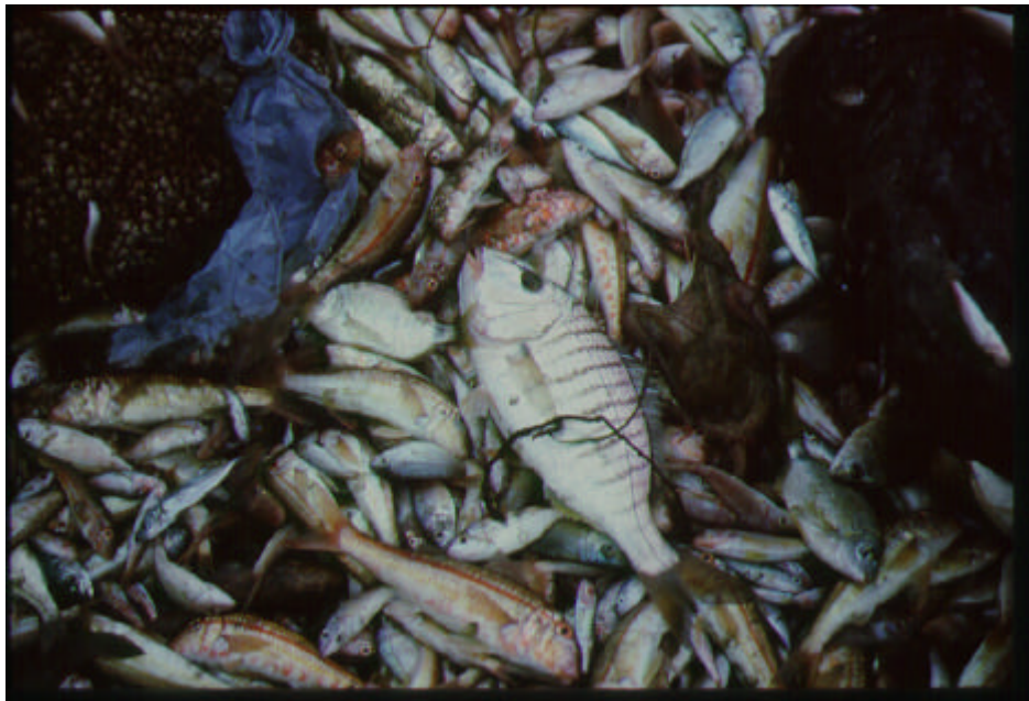
Capture of juveniles by trawling in shallow water.

In 1999, a Memorandum of Understanding (MoU) was concluded between the Regional Activity Centre for Specially Protected Areas (RAC/SPA), and the Fisheries Department of the Food and Agriculture Organisation of the United Nations (FAO) concerning the role to be played by FAO within the framework of SAP Biodiversity project. The SAP Biodiversity is expected to provide a logical basis for implementation of the 1995 SPA Protocol; it will analyse issues and identify action at national and regional levels.