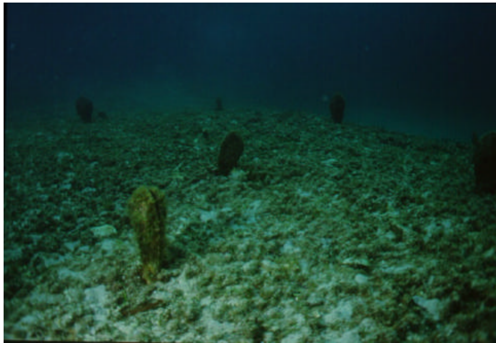
The mollusc Pinna nobilis is one of the species listed in the annex II of the SPAMI protocol.

States should take all necessary steps to ensure that conservation and management measures be properly enforced throughout the waters under their sovereignty and jurisdiction.