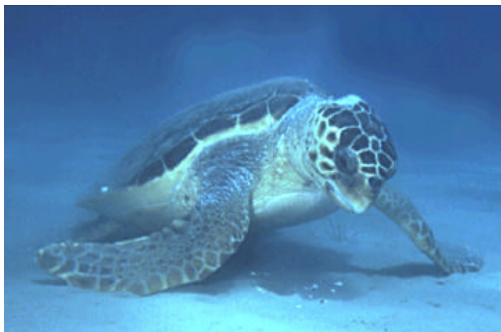
Caretta caretta is one of the endangered species in the Mediterranean. D.Cebrian

A demographic model for the Mediterranean population of loggerhead turtles showed that adult survival was the main factor affecting population growth rates, fecundity being less significant (Laurent et al., 1992). Turkey is a key country regarding the total number of nesting females for the three mentioned species breeding in the Mediterranean, though fishing practices around the entire basin affect their populations.