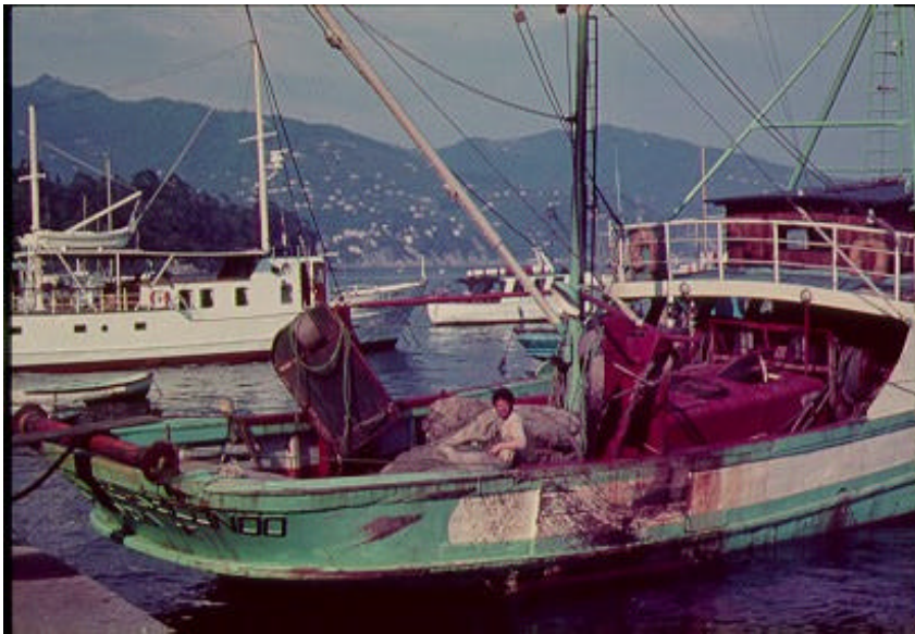
Trawl fishing: Trawlers have dramatic effects on the ecosystem including physical damage to the seabed and the degradation of associated communities.

Bottom trawling fleets predominate in many Mediterranean fisheries, being responsible for a high share of total catch and, in many cases, yielding the highest earnings among all the fishing sub-sectors. The high profitability of this fishing practice is largely due to its low selectivity with respect to size and species caught, and to the high harvests generated.