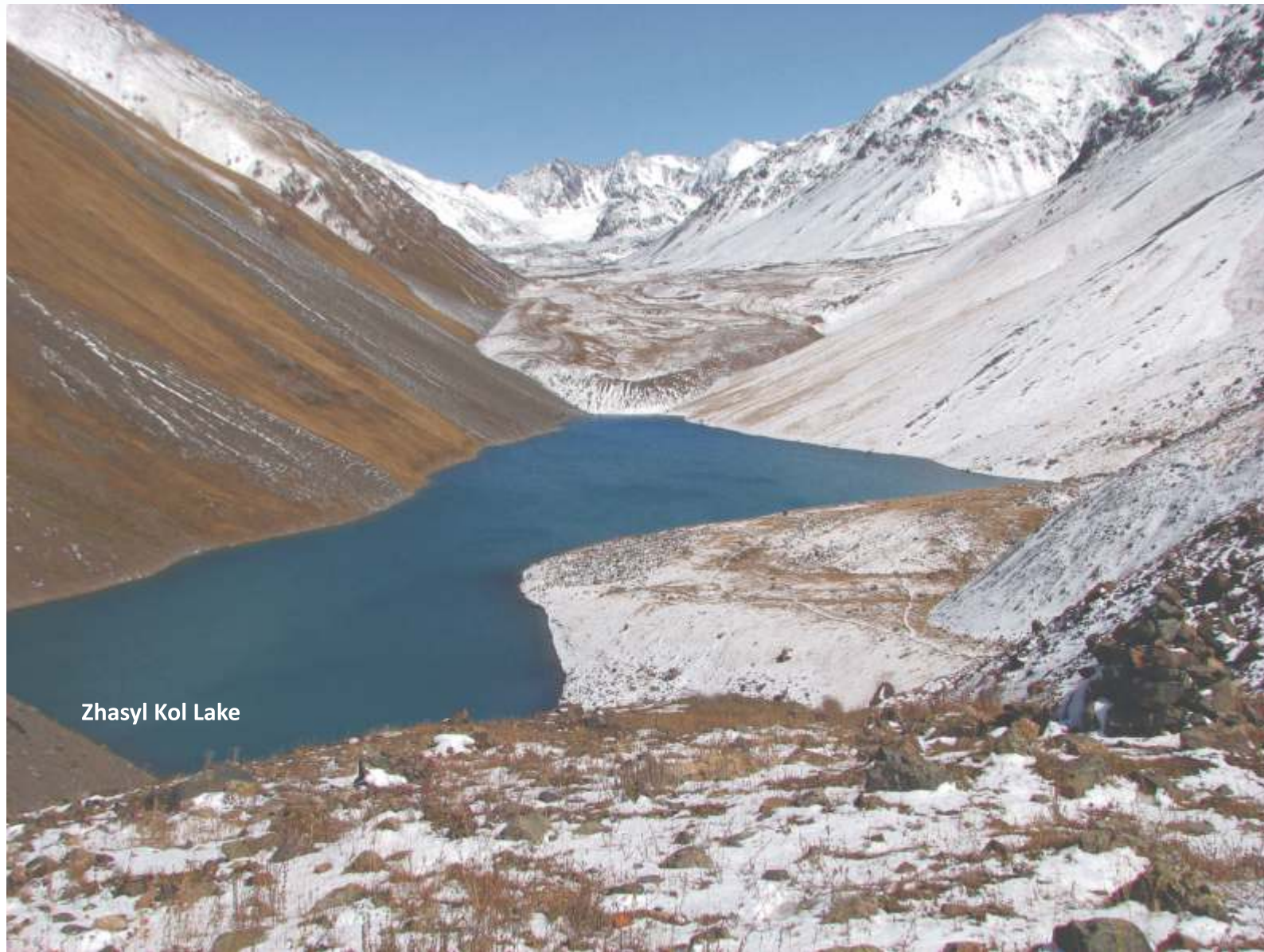
Zhasyl Kol Lake

Diagnostic Report and Cooperation Development Plan