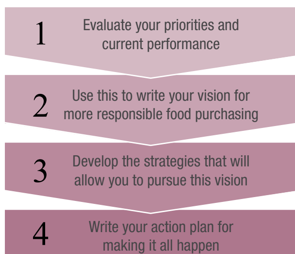
Figure 2. How to apply your priorities based on current performance

The vision-strategy-action plan approach is likely to be most appropriate for larger companies in the hospitality sector. SMEs may find it more appropriate to begin by evaluating their priorities and performance, and then going directly to writing an action plan.