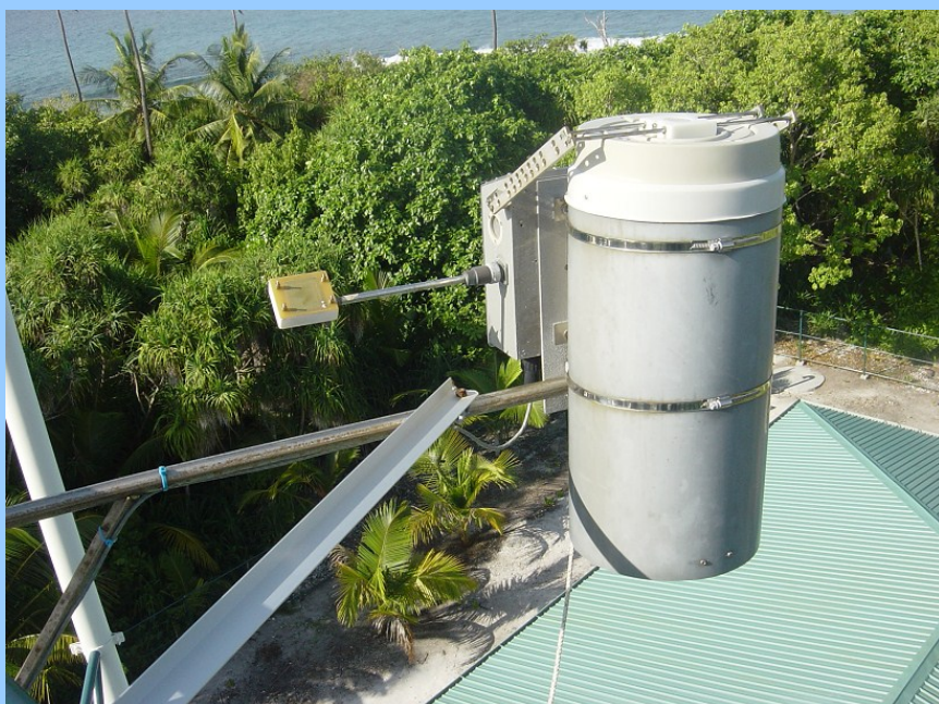
Figure 1: Wet deposition monitoring facilities at the Maldives Climate Observatory on Hanimaadhoo (MCOH)

While freshly emitted black carbon particles are known to be hydrophobic, that is, slightly prone to absorb water and be incorporated in cloud droplets and scavenged by precipitation, it is often assumed that within a few days such particles are coated by water soluble materials, including sulphates and organics. Systematic measurements of black carbon in both rainwater and airborne aerosol particles at the Maldives Climate Observatory on Hanimaadhoo (MCOH) have