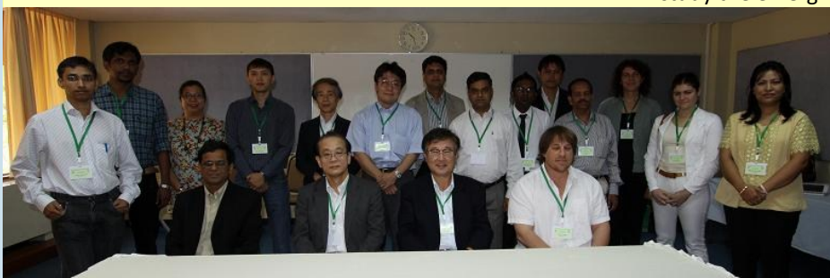
Participants of the ABC observatory group meeting held in Bangkok, Thailand