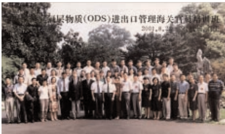
Participants at the Customs Training Workshop in Hangzhou, China

Fifty-eight customs trainers, senior officers and other stakeholders participated in a three-day Customs Training Workshop in Hangzhou, China last August. The workshop, funded by the World Bank and organized by the State Environment Protection Administration (SEPA) in consultation with UNEP DTIE and other local partners, focused on national ODS regulations and import/export licensing systems.