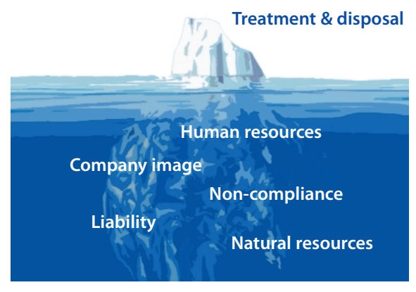
The visible costs of waste are just the tip of the iceberg.

Implement Cleaner Production to make your company more cost-effective. Use materials, energy, fuel and other resources more efficiently and cut costs of waste disposal and input purchases. Your company will become more competitive, as Cleaner Production practices improve your image and the quality and safety of your products. Cleaner Production also reduces environmental, health and liability risks. And by conforming to environmental standards, your company can export to new markets.