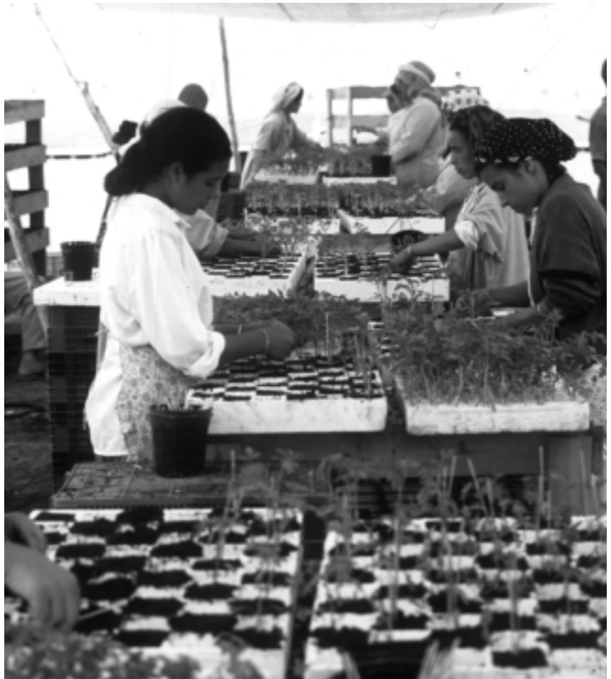
Production of grafted tomato seedlings in Morocco