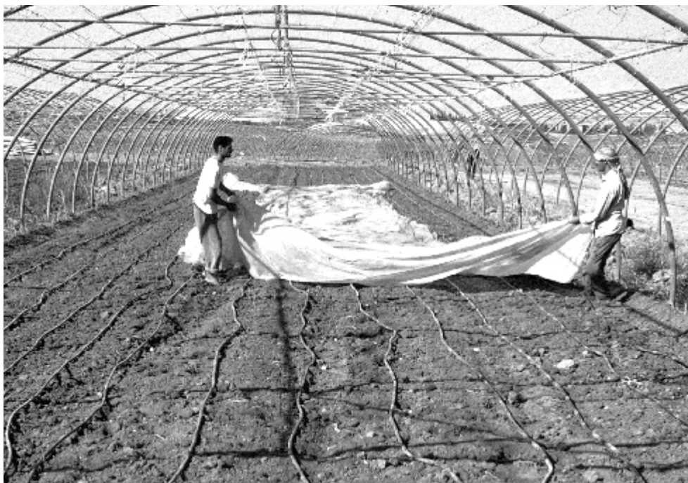
Solarization sheets being laid over irrigation pipes in Jordan