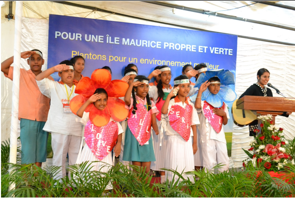
Song on Environment by Students of the NGO Indian Ocean Centre for Education in Human Values