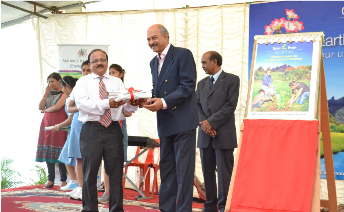
Symbolic handing over of pamphlet and poster on Tree Planting by Hon. Devanand Virahsawmy, GOSK, FCCA, Minister of Environment and Sustainable Development