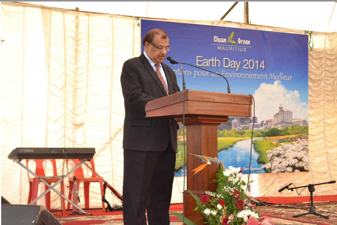
Address by Hon. Dr Vasant Kumar BUNWARÉE, Minister of Education and Human Resources