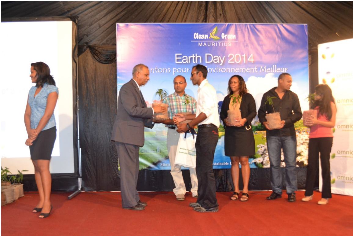
Symbolic handing over of plants and cloth bags by Dr the Hon Abu Twalib KASENALLY, GOSK, FRCS, Minister of Housing and Lands