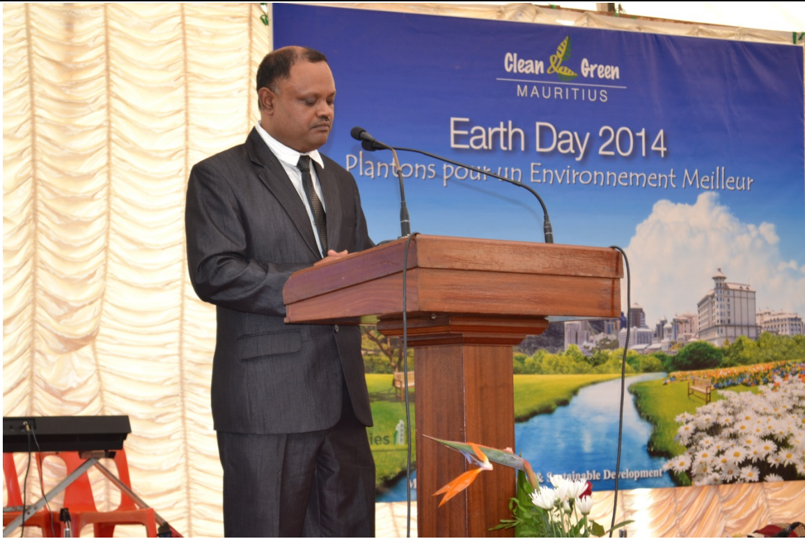
Welcome address by Rector of the RISS