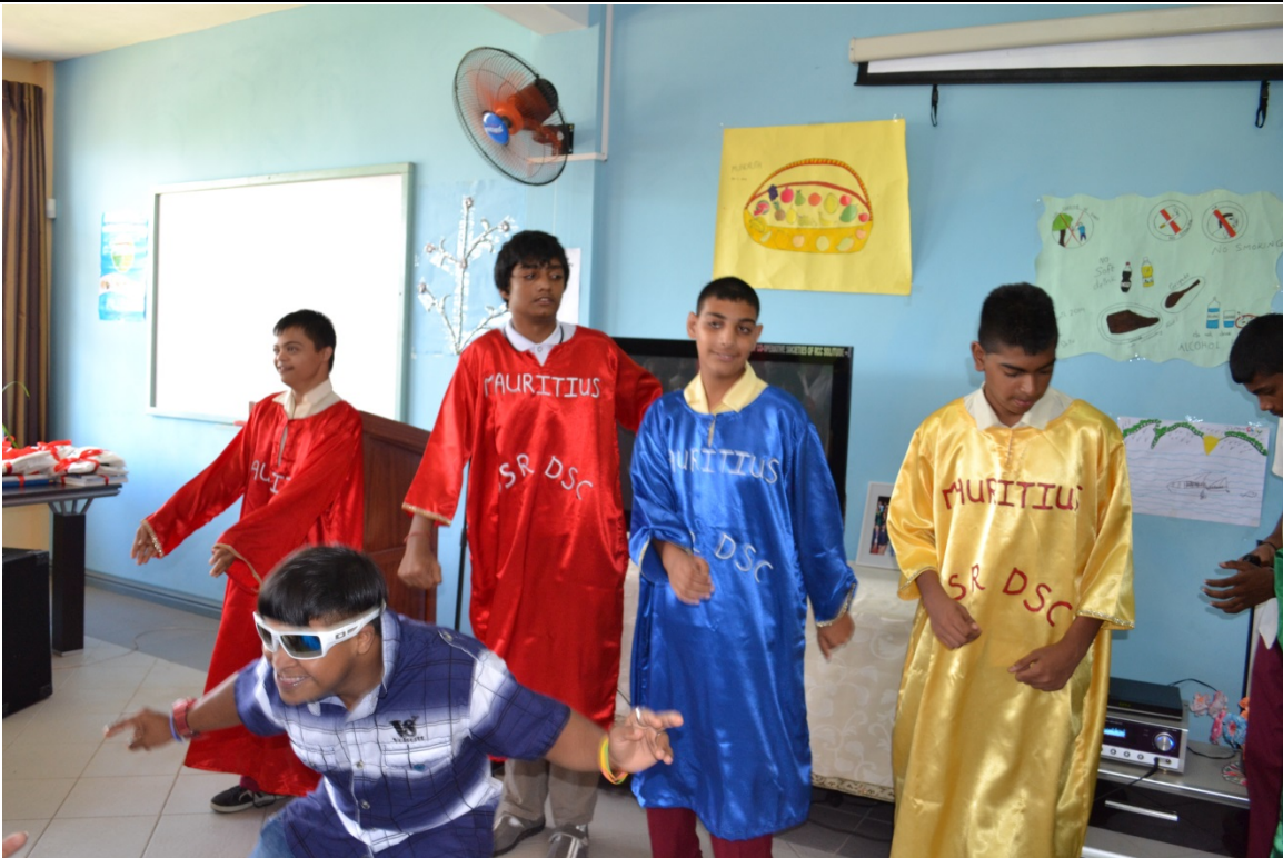
Dance item by Students of SSR Disability Centre