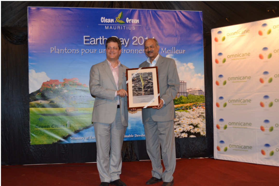
Handing over gift to Hon. Devanand VIRAHSAWMI, GOSK, FCCA, Minister of Environment and Sustainable Development