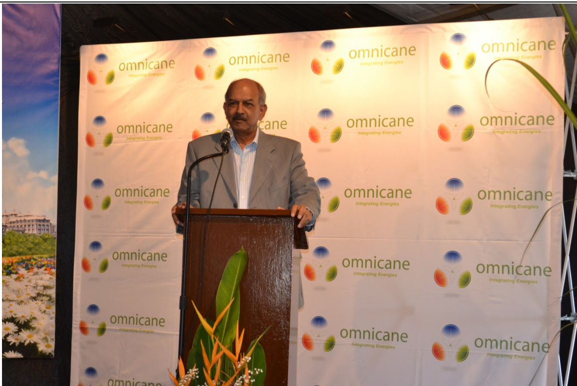
Address by Hon. Devanand VIRAHSAWMIY, GOSK, FCCA, Minister of Environment and Sustainable Development