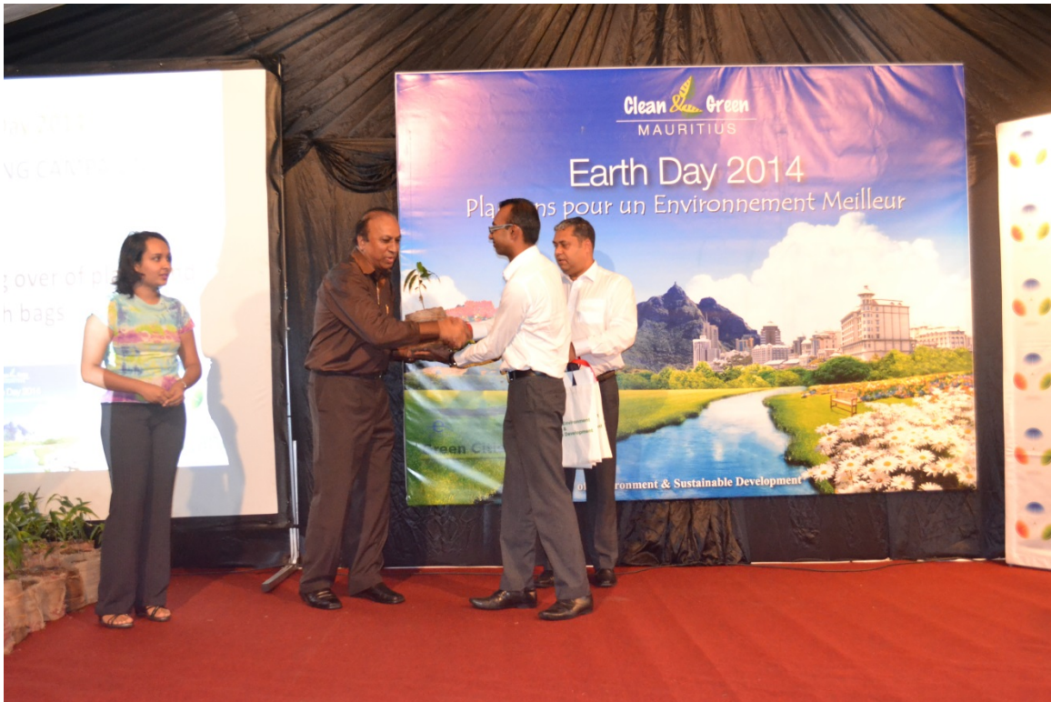
Symbolic handing over of plants and cloth bags by Hon Maneswar PEETUMBER, Deputy Speaker