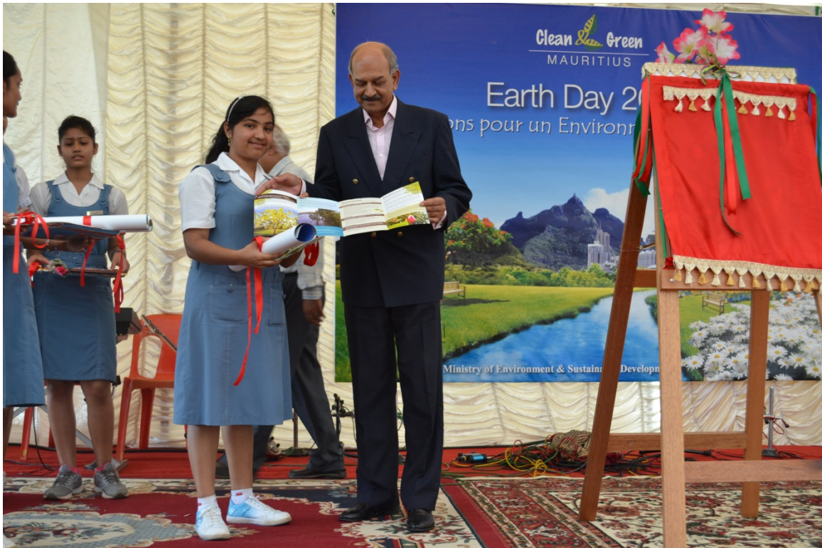
Launching of pamphlet on Tree planting by Hon. Devanand Virahsawmy, GOSK, FCCA, Minister of Environment and Sustainable Development