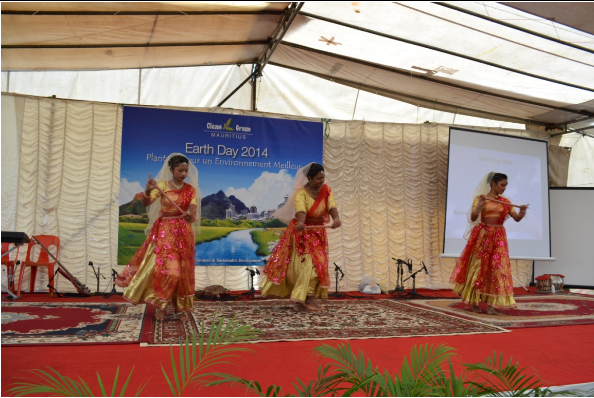
Cultural Items by students of the TRSS (Dance)