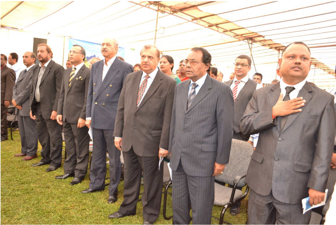
National Anthem Song