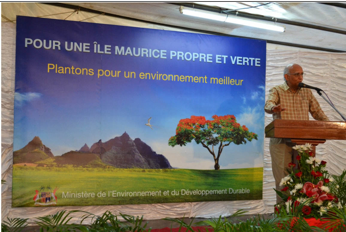
Address by Dr the Hon. Ahmed Rashid Beebeejaun, GCSK, FRCP, Deputy Prime Minister and Minister of Renewable Energy and Public Utilities