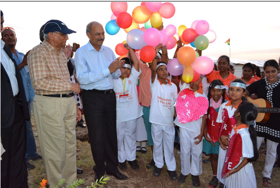
Students of the NGO Indian Ocean Centre for Education in Human Values