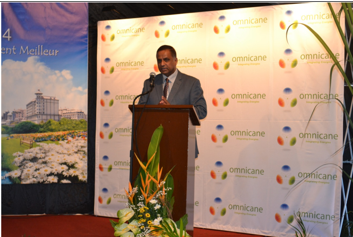
Address by Hon. Tassarajen PILLAY CHEDUMBRUM, Minister of Information and Communication Technology