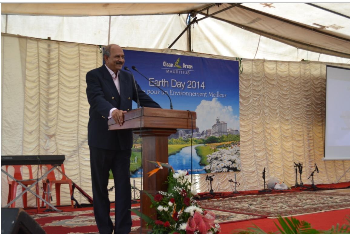
Address by Hon. Devanand Virahsawmy, GOSK, FCCA, Minister of Environment and Sustainable Development