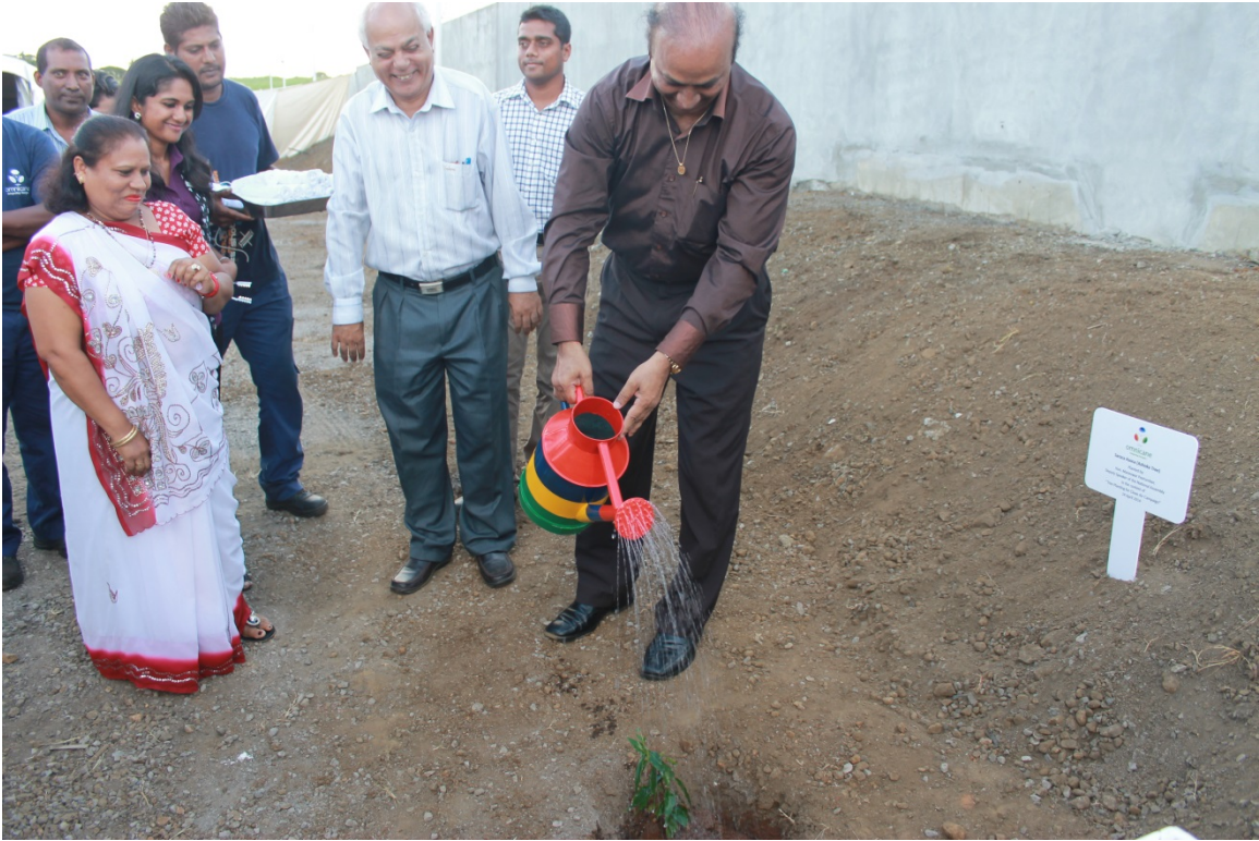
Tree planting by Hon. Maneswar PEETUMBER, Deputy Speaker