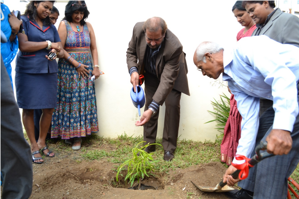
Tree planting by Hon. Devanand RITTOO, Ministry of Youth and Sports