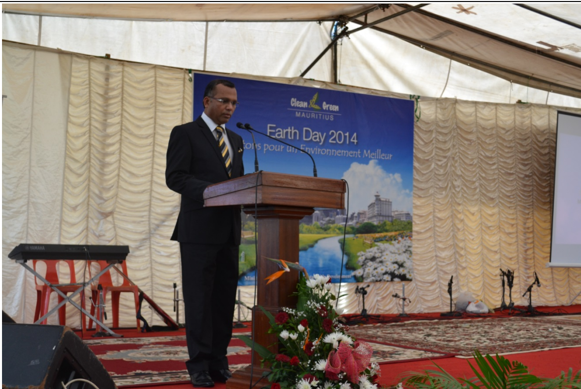
Address by Hon. Satya Veyash FAUGOO, Minister of Agro-Industry and Food Security and Attorney General