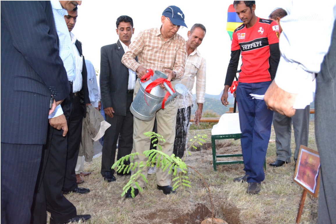
Tree planting by Dr the Hon. Ahmed Rashid Beebeejaun, GCSK, FRCP, Deputy Prime Minister and Minister of Renewable Energy and Public Utilities