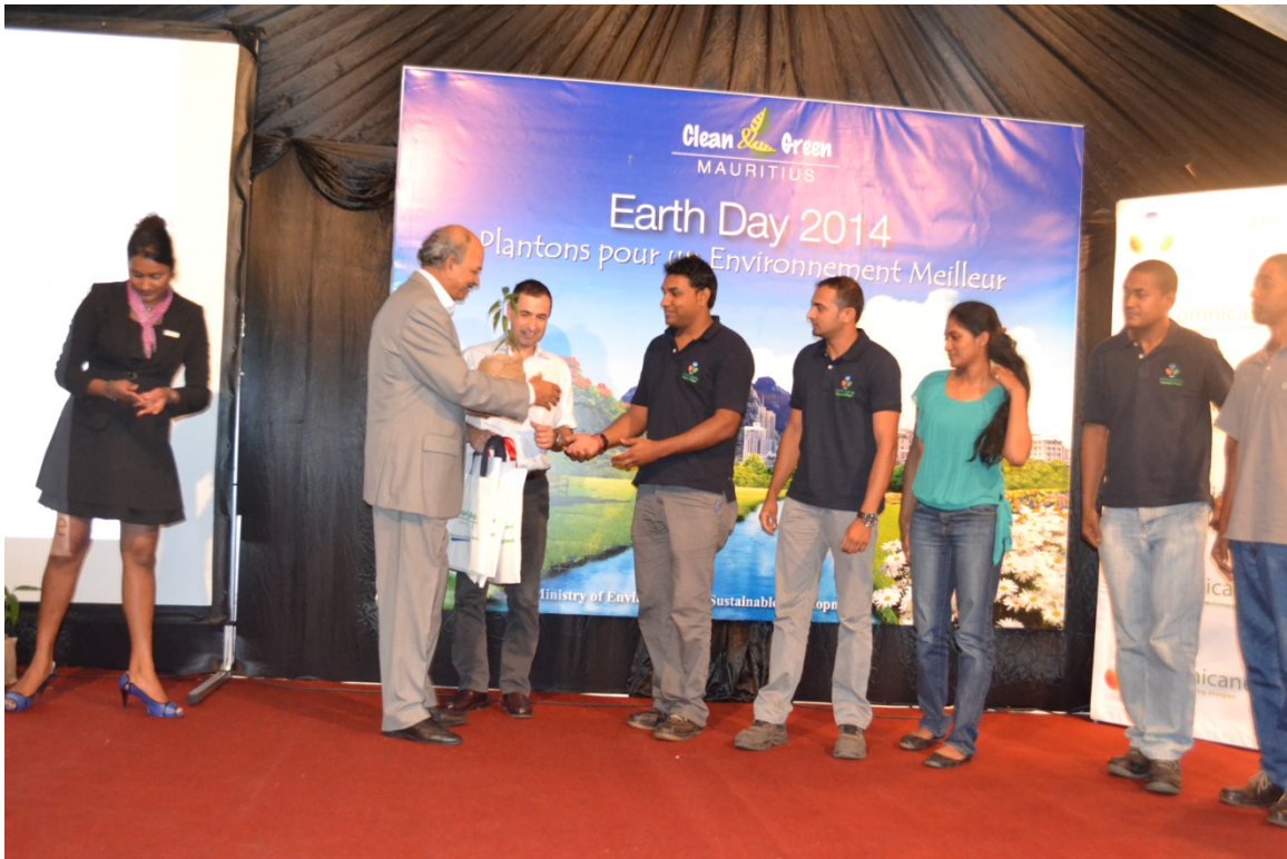
Symbolic handing over of plants and cloth bags by Hon. Devanand VIRAHSAWMY, GOSK, FCCA, Minister of Environment and Sustainable Development