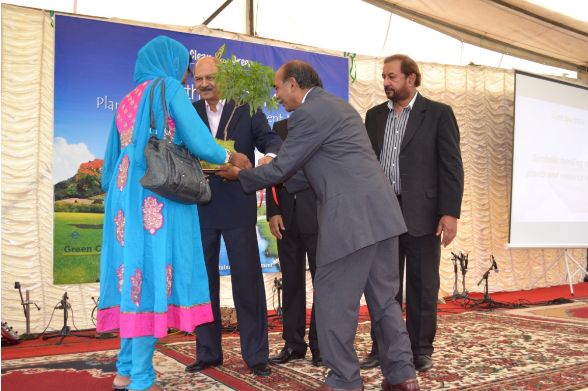
Symbolic handing over of tree/plant by Hon. Devanand Virahsawmy, GOSK, FCCA, Minister of Environment and Sustainable Development