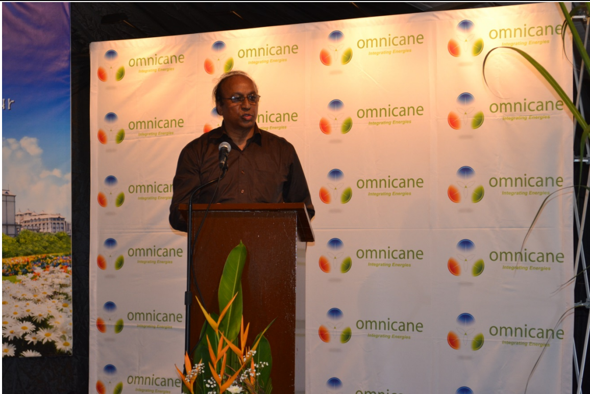
Address by Hon. Maneswar PEETUMBER, Deputy Speaker