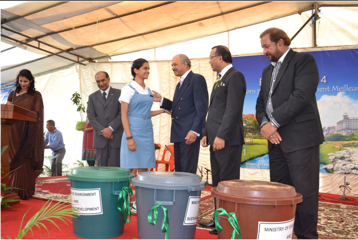
Symbolic handing over of Waste Segregation bins by Hon. Devanand Virahsawmy, GOSK, FCCA, Minister of Environment and Sustainable Development