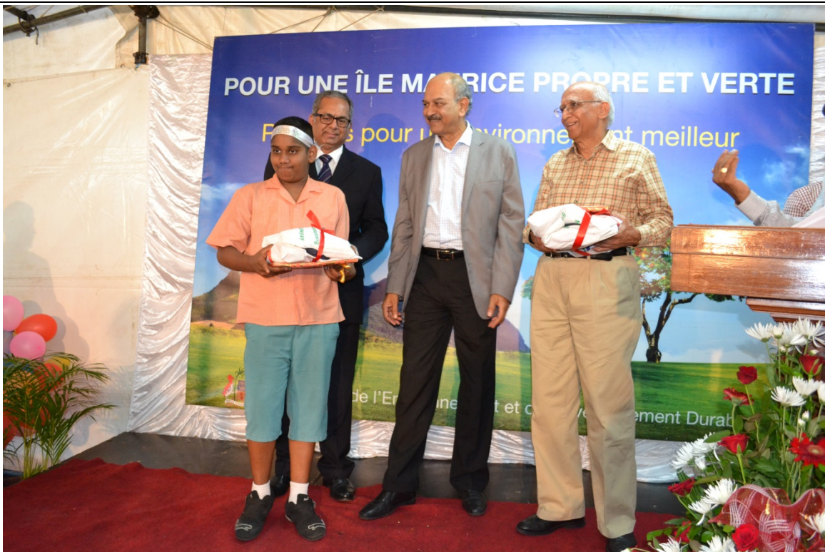
Symbolic distribution of Eco bags, T-Shirts and Resource materials to students of the NGO Indian Ocean Centre for Education in Human Values