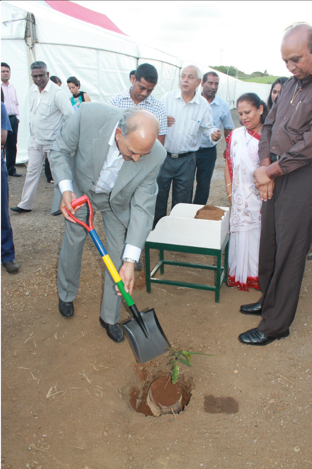
Tree planting by Hon. Devanand VIRAHSAWMI, GOSK, FCCA, Minister of Environment and Sustainable Development