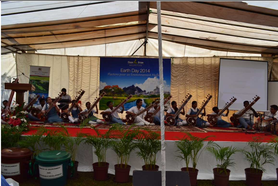
Cultural Items by students of the TRSS (Musical)