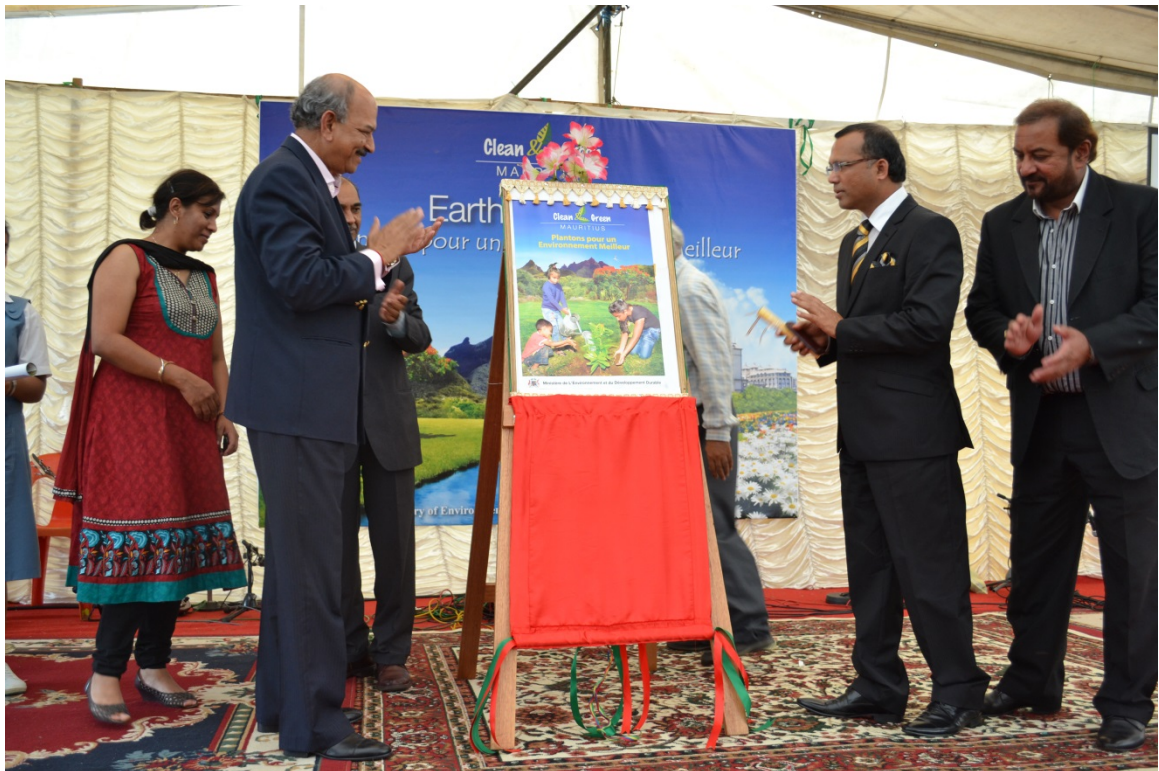
Launching of poster on Tree planting by Hon. Devanand Virahsawmy, GOSK, FCCA, Minister of Environment and Sustainable Development