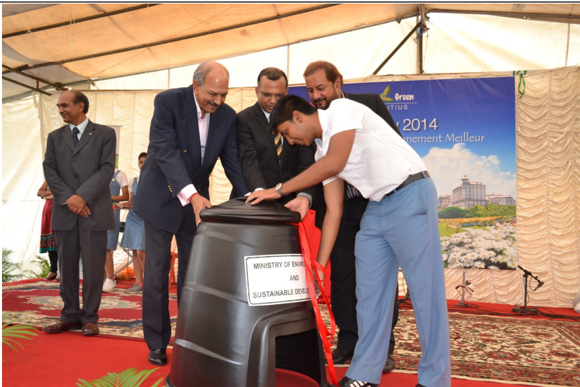
Symbolic handing over of compost bins by Hon. Devanand Virahsawmy, GOSK, FCCA, Minister of Environment and Sustainable Development