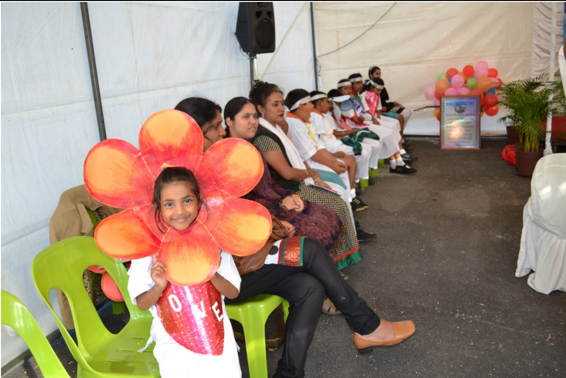
Students of the NGO Indian Ocean Centre for Education in Human Values