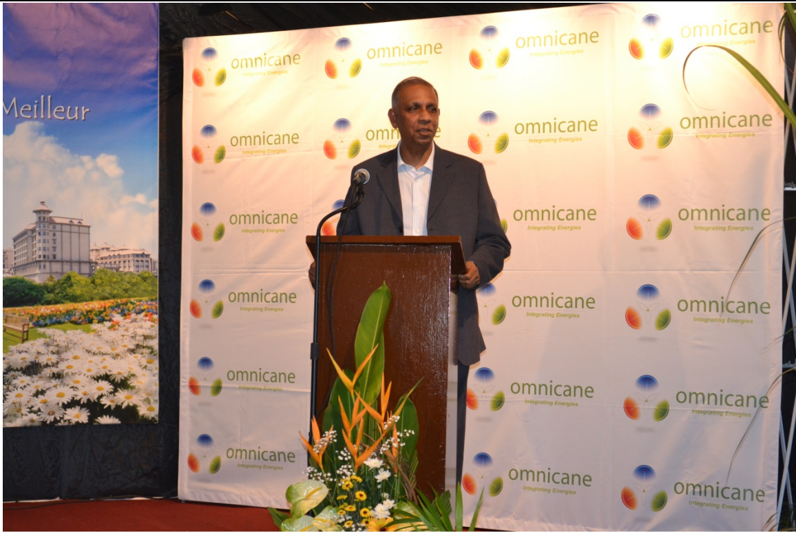
Address by Dr the Hon Abu Twalib KASENALLY, GOSK, FRCS, Minister of Housing and Lands