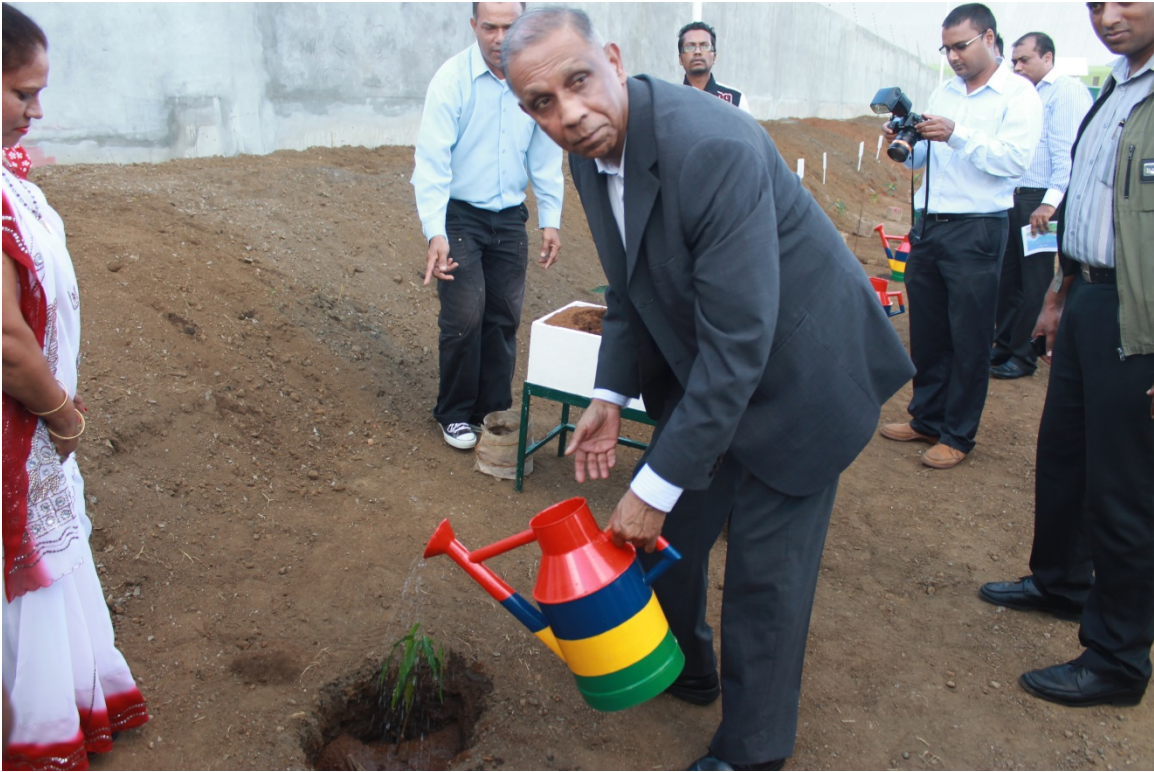
Tree planting by Dr the Hon Abu Twalib KASENALLY, GOSK, FRCS, Minister of Housing and Lands