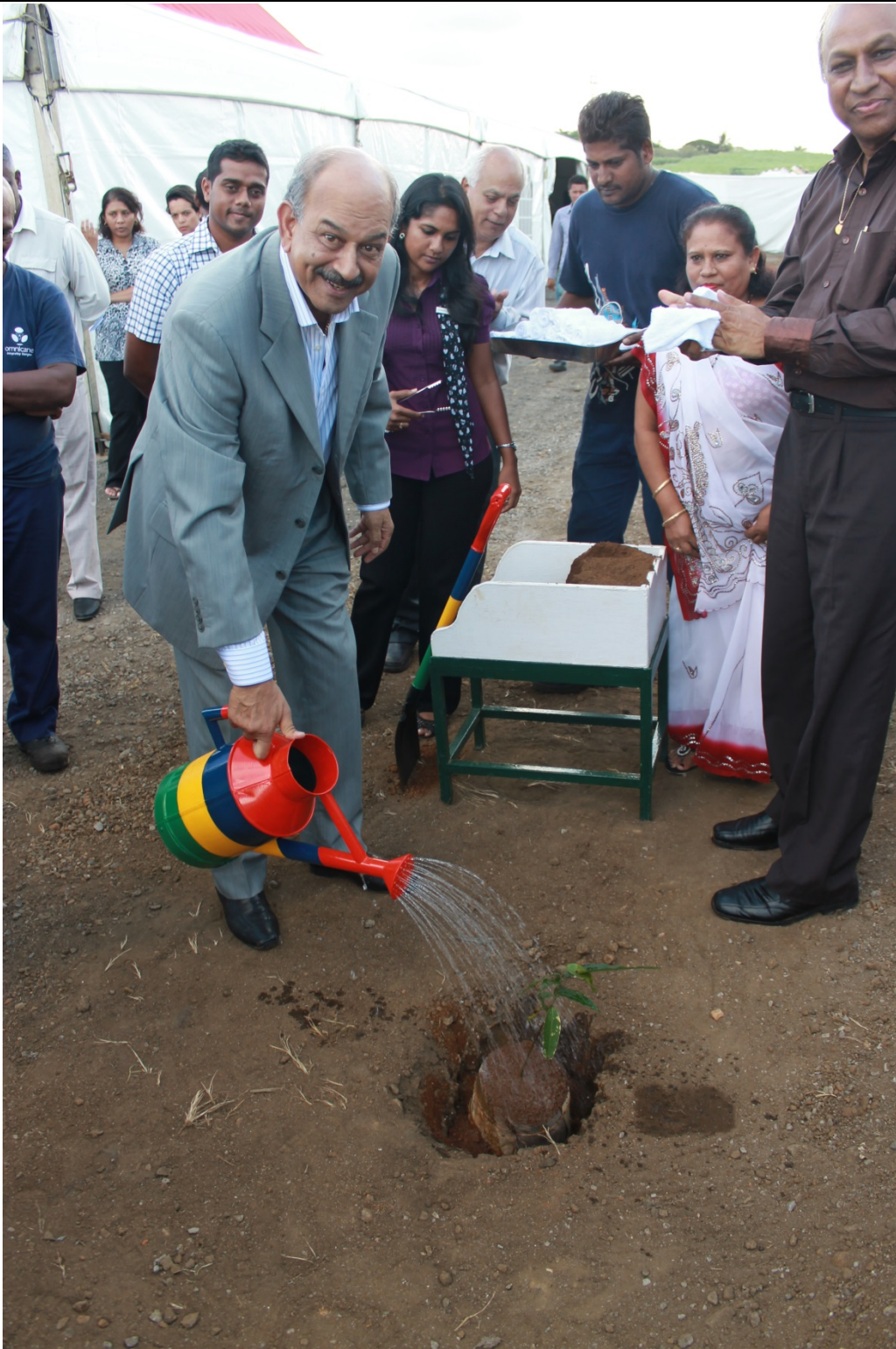
Tree planting by Hon. Devanand VIRAHSAWMI, GOSK, FCCA, Minister of Environment and Sustainable Development