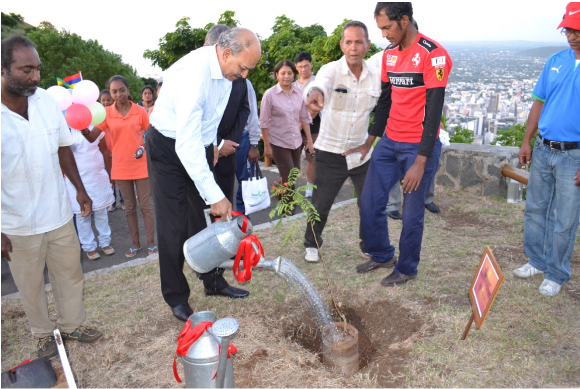
Tree planting by Hon. Devanand Virahsawmy, GOSK, FCCA, Minister of Environment and Sustainable Development