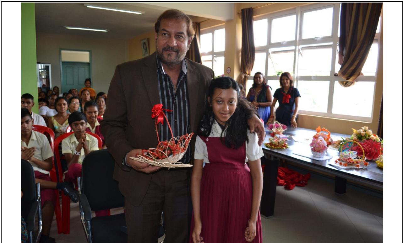
Gifts given by student of SSR Disability Centre to Hon. Devanand RJTIOO, Ministry of Youth and Sports