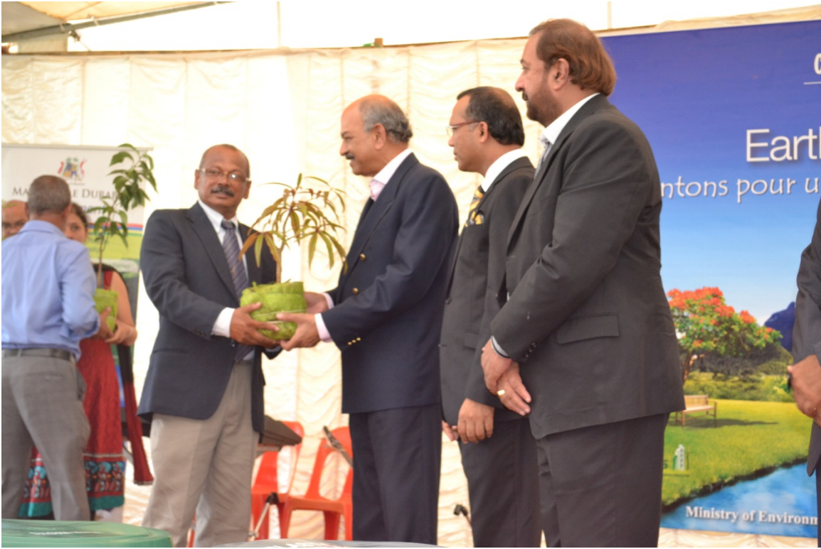
Symbolic handing over of tree/plant by Hon. Devanand Virahsawmy, GOSK, FCCA, Minister of Environment and Sustainable Development