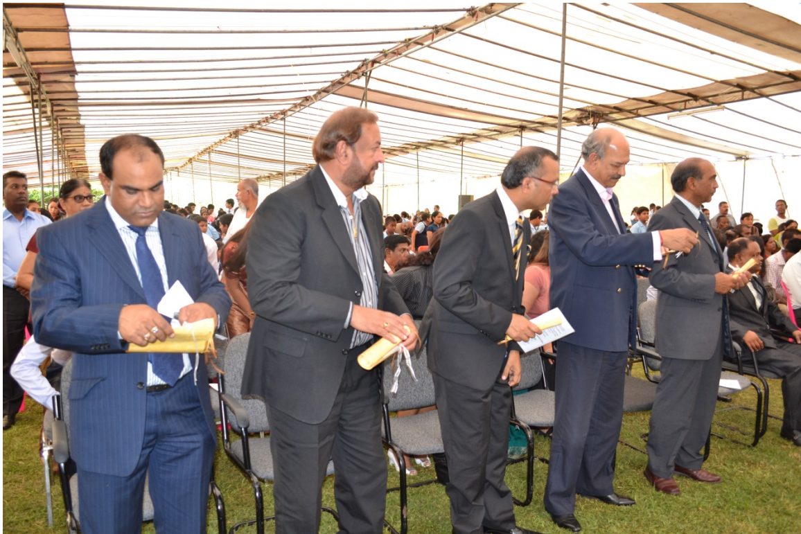
Pledge by students of the TRSS