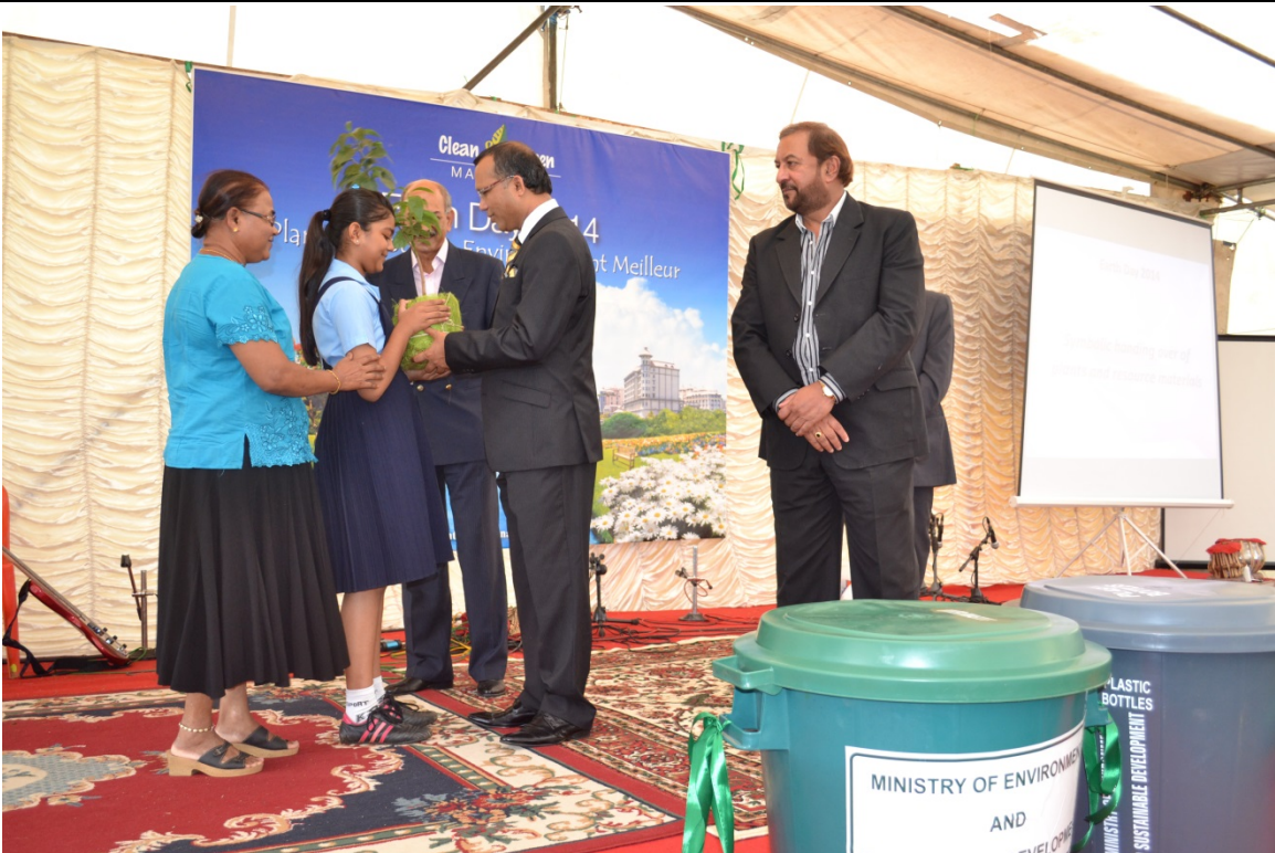
Symbolic handing over of tree/plant by Hon. Satya Veyash FAUGOO, Minister of Agro-Industry and Food Security and Attorney General