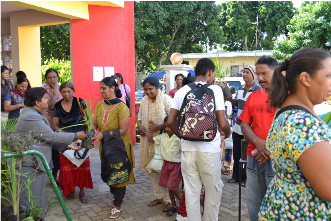
Distribution of cloth bags and plants to children and parents