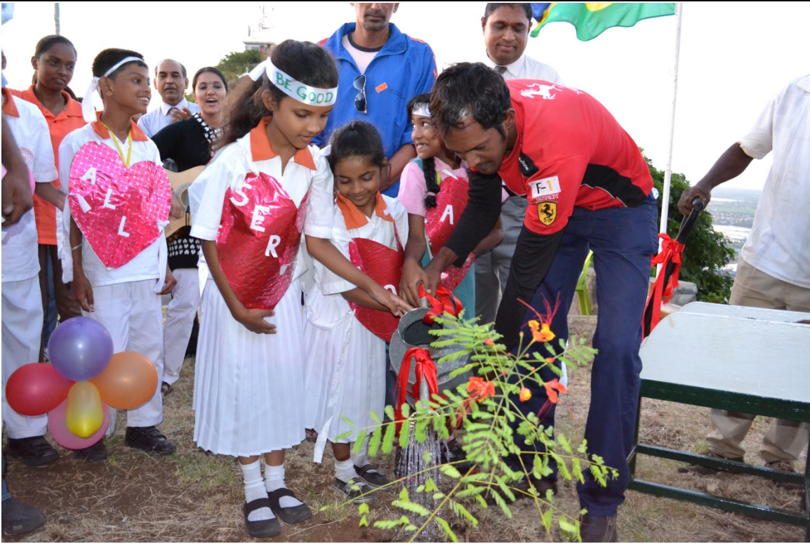
Tree planting by Students of the NGO Indian Ocean Centre for Education in Human Values