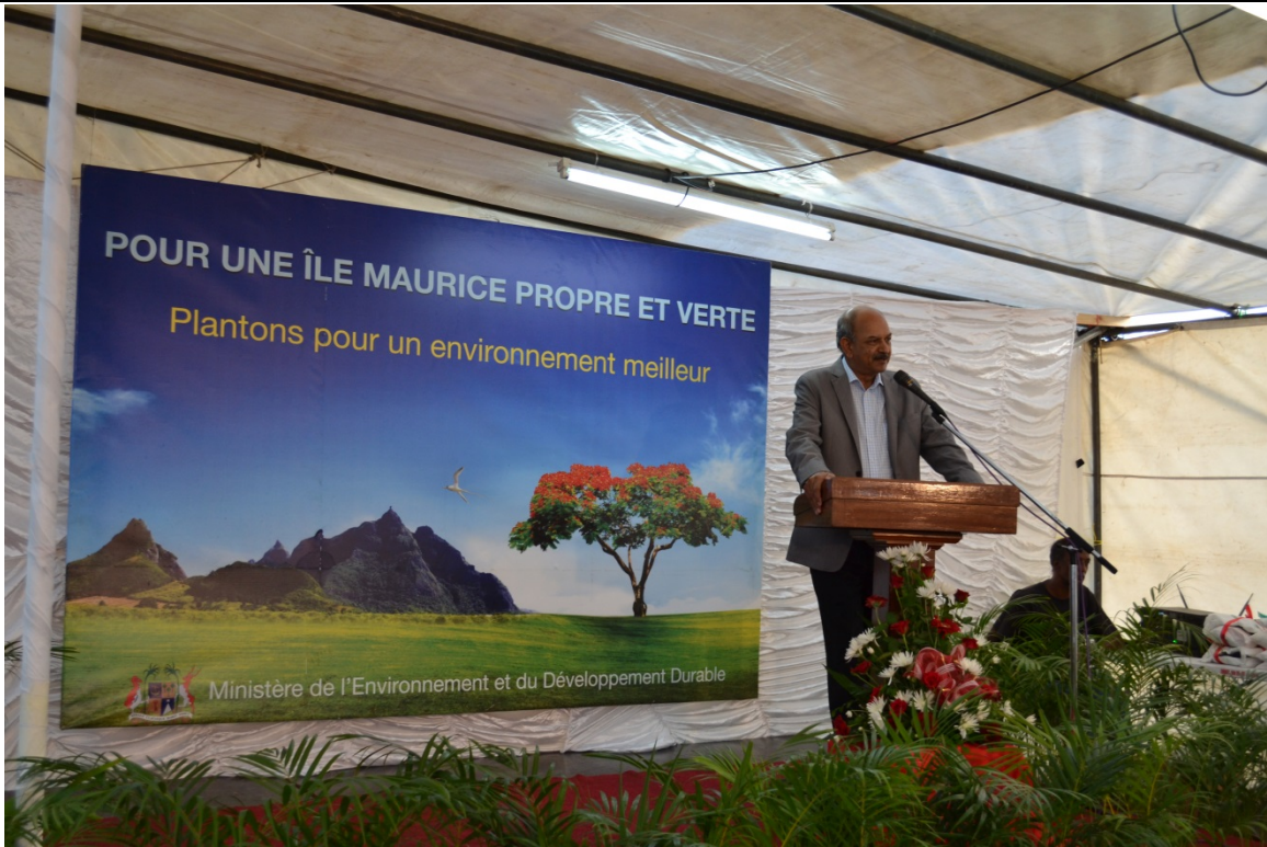
Address by Hon. Devanand Virahsawmy, GOSK, FCCA, Minister of Environment and Sustainable Development