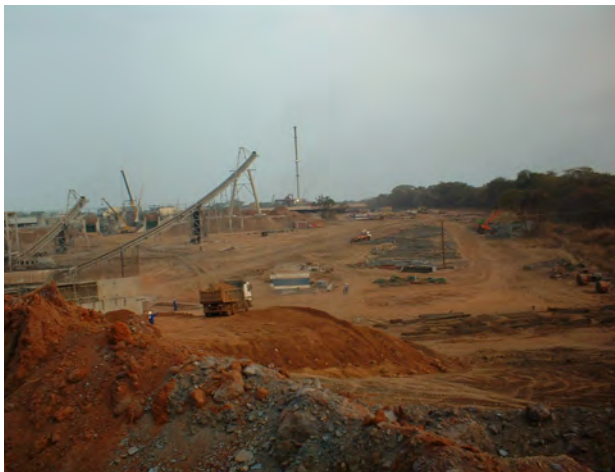
Industrial and commercial development in Zambia, particularly large-scale mining and the growth in manufacturing activities, and a corresponding increase in population have brought about the risk of environmental damage by exerting unmitigated pressures on the environment.

In an effort to ensure that environmental concerns are integrated into economic development and as a way of preventing, minimising, mitigating or compensating for adverse environmental impacts, the government introduced the EIA process and therefore promulgated and gazetted the EIA Regulations, Statutory Instrument No.28 of 1997 (SI 28, 1997).