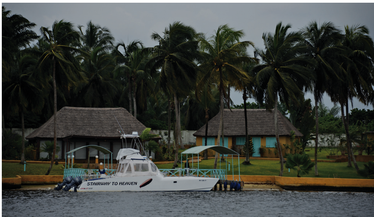
The Ébrié lagoon can become a growth engine promoting tourism and other economic activity

At present, Ébrié Lagoon is a foul, unsightly waterbody that does not offer aesthetic or ecosystem benefits to the population. However, the UNEP assessment has shown that only 10 percent of the lagoon is subject to severe anthropogenic impact. The lagoon could recover.