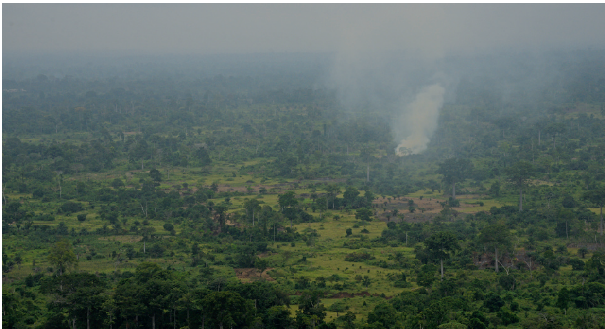
Ongoing deforestation is a big concern

sensing analyses and a scope of work was agreed with the Government for field work. Fieldwork for the PCEA was conducted in June and August 2013. A number of national experts joined the field work. Chemical analyses of the samples and further remote-sensing studies were conducted between August and October 2013. During 2014, the draft report was prepared and submitted to the government and external peer reviewers.