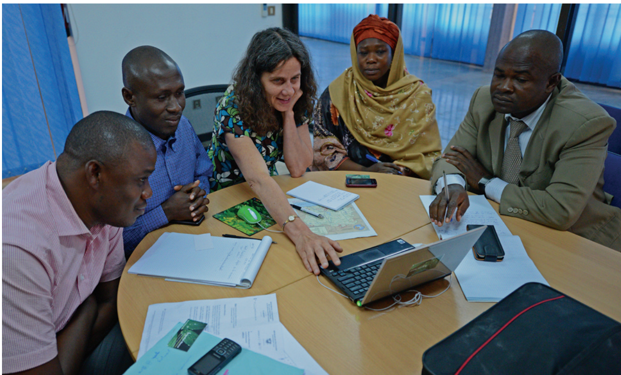
A number of local experts joined the assessment mission

The new government of Côte d'Ivoire, which came into power after the 2010 elections, made a formal request to UNEP for a post-crisis environmental assessment (PCEA). In responding to the request, UNEP conducted a desk study and remote