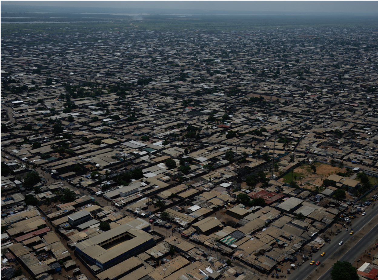
Abidjan has doubled in population since 2001